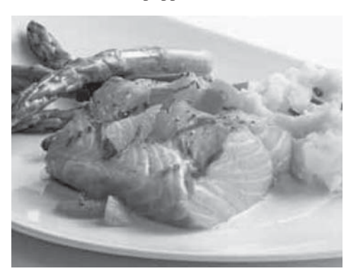
Wild Alaska Salmon with Cara Cara Orange

An ideal remedy for the heat and humidity, the Heirloom Tomato Gazpacho ($6.99) is a particularly refreshing starter. A cold soup of Spanish origin, gazpacho in questionable hands can sometimes taste too much like a nondescript mild salsa. The McCormick and Schmick's version is tangy and vibrant. Topped with lemon crème fraiche and also featuring chopped onion and cucumber along with several shrimp croutons (similar in texture if not in sweetness to hushpuppies), this is one of the