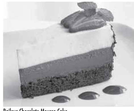
Baileys Chocolate Mousse Cake A pioneer in the world of happy hour, McCormick & Schmick's has always featured

McCormick & Schmick's has also unveiled a new lunch menu, with debuting items including Shrimp and Bay Scallop Fettucini, Crispy Fried Cod Sandwich and Chicken Portobello Sandwich. Those looking for a refreshing beverage can also order one of many excellent Summer Refreshers. The non-alcoholic options (each $5.00) include Strawberry Lemonade (with homemade simple syrup), Sunset Punch (with strawberry, pineapple, apple, orange and grapefruit juices), and Blackberry Splash (with simple syrup and lemonade). Drinks with alcohol include the Mango Mojito, Perfect Patron Margarita and Prosecco Sangria.