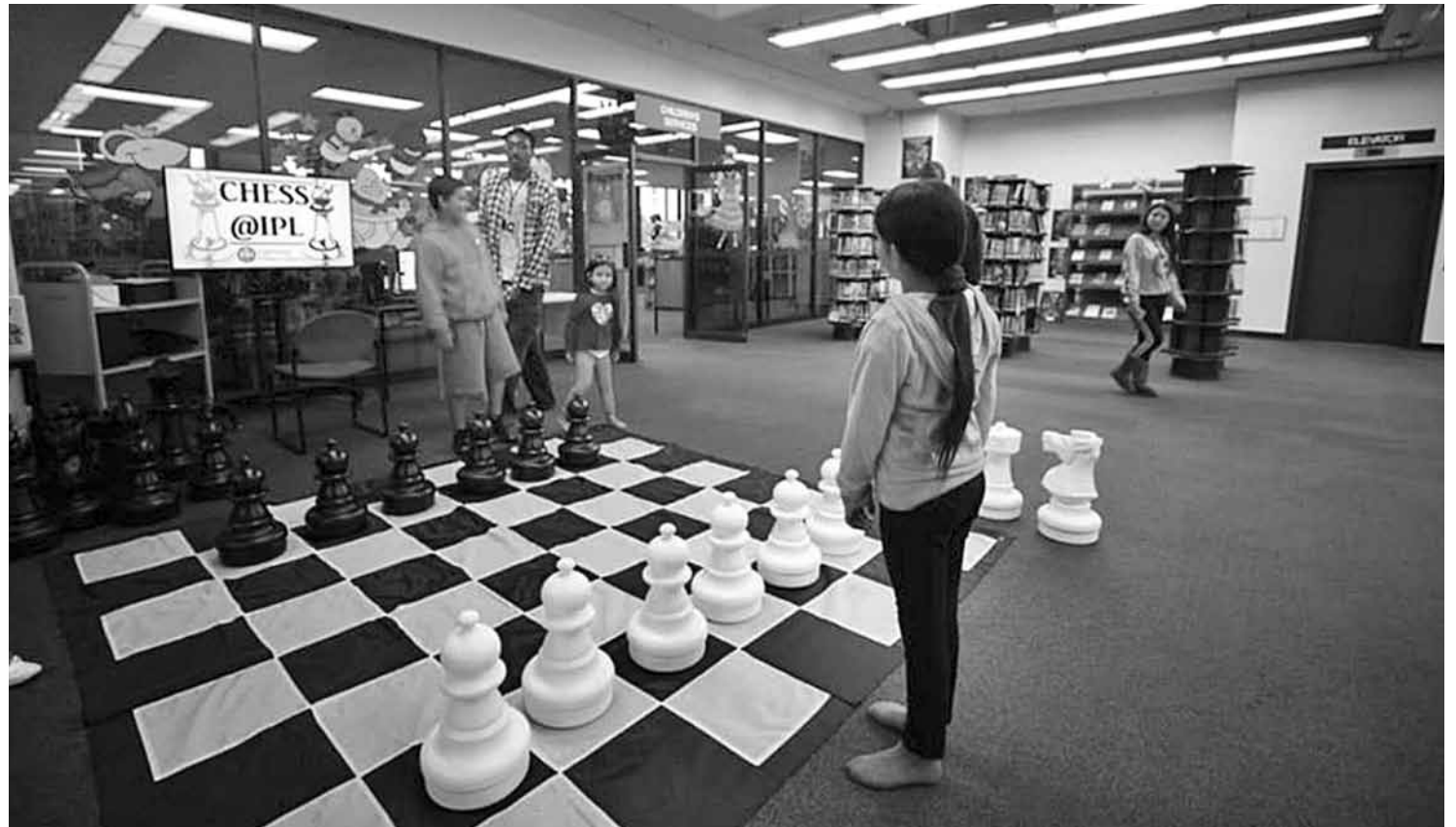
The Inglewood Public Library gives lessons to children of any age and up on how to improve and development their skills of chess. Here is a photo from this week, showing that kids are already on board.