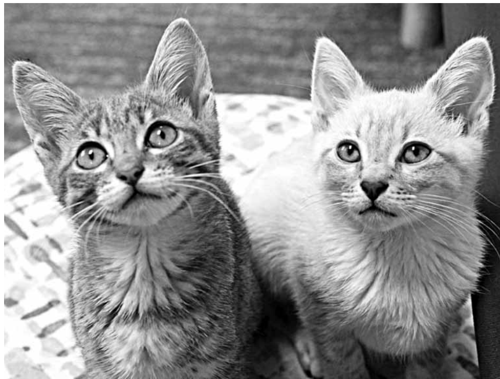
Katrina (left) and Vanilla

loves exploring and discovering that perfect, cozy nook where she can nap or just watch you work. While not a lap cat, Del enjoys being wherever you are. In a show of kindness, she several times presented her toys to another kitty for whom Del's foster mum is caring. The other kitty, named Florence, is extremely shy, but once she touched noses with Delphine, the two were fast friends. Both cats love playing together and chasing each other around their foster's home. Once a young mom herself, all of Delphine's kittens have been adopted, and now it's this lovely lady's turn to greet you when you return home (usually with a favored toy) and become your forever companion.