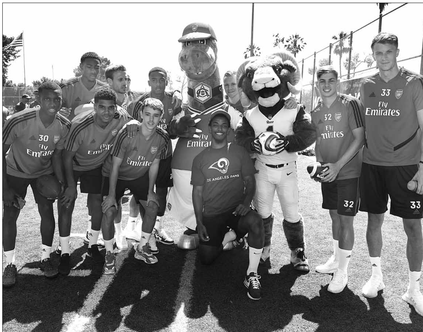
On Saturday, July 13, the Los Angeles Rams and Arsenal Football Club co-hosted a free "FootBALL" clinic for Inglewood Youth to teach fundamentals in both American football and soccer.