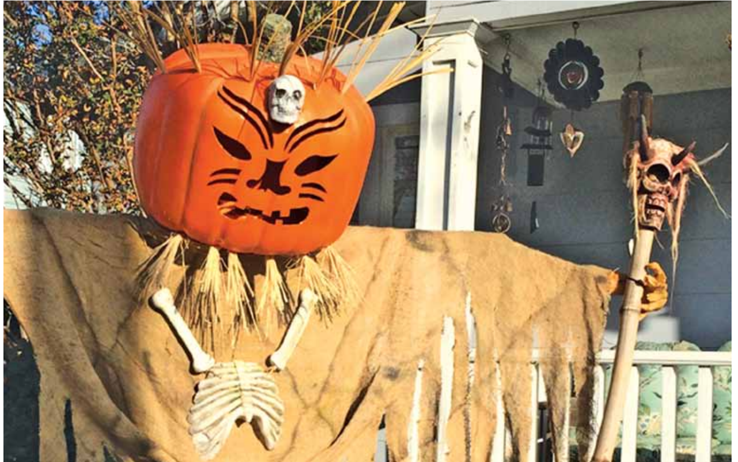
South Bay residents are decorating their houses, and their children, and themselves, for our national day of candy feasting. Have a safe Halloween and enjoy your tricks and treats!