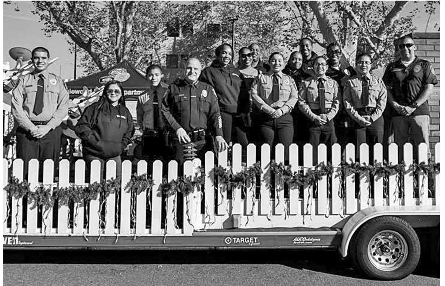
The Inglewood Police Department hosted another successful Stuff the Trailer toy drive to help out local families during the holiday season.