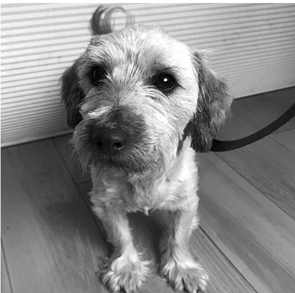
Congratulations to Brady and his new family!

Congratulations to Brady and his new family. Call it Kismet, destiny or "written in the stars," but this definitely was meant to be. Brady's new dad came to Petco with his 13-year-old Wheaten Terrier, Becker, to do some shopping and Brady caught his eye. It could have been the face or the fact that Brady looks like a "mini" Wheaten. Dad took a few pictures to show Mom and a few days later, a meet and greet took place with Mom, Dad and Becker. The rest, as they say, is history. Brady immediately settled in and it's as if he has always been part of the family. Brady, now named Theo, is living life large in Manhattan Beach and loving having Becker for a big brother. Wishing much happiness and great times ahead for everyone!