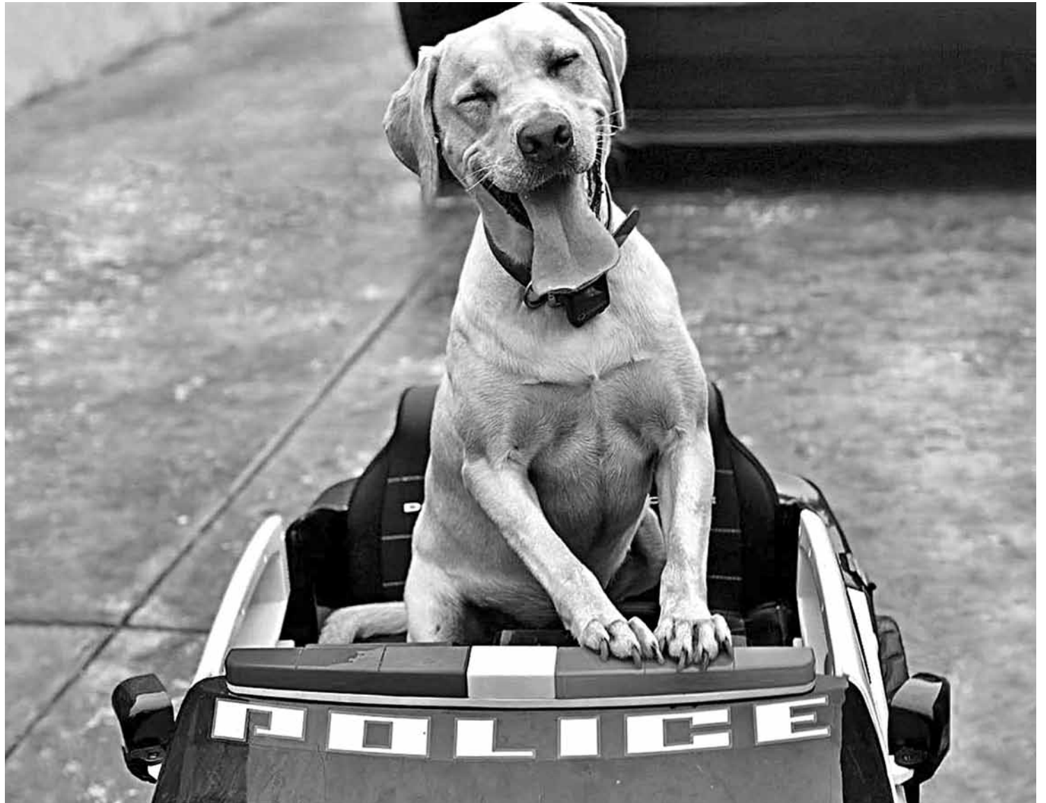
Hey, Flynn! Is that your new K9 vehicle? He just might be the happiest K9 ever.