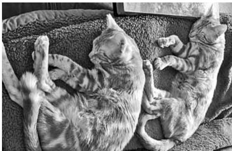
Opie and Rusty.

Opie and Rusty are bonded twin brothers looking for a forever home. They are quite the little pair – they play together, eat together,