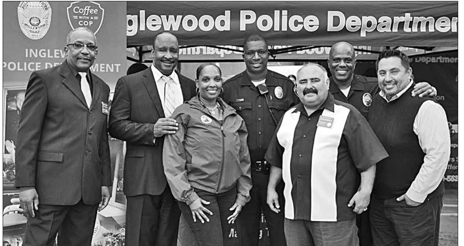
Inglewood police officers, community leaders and local neighbors came out to Randy's Donuts on Oct. 3 to chat and enjoy cups of Joe as part of National Coffee with a Cop Day.