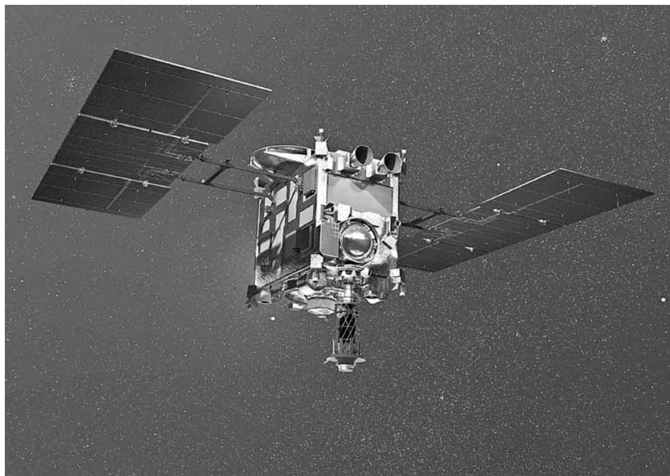
A MASCOT animation still, courtesy of DLR.

With the data acquired by MASCOT and the samples that Hayabusa2 brings to Earth from Ryugu in 2020, scientists will not only learn more about asteroids, but more about the formation of the solar system. "Asteroids are very primordial celestial bodies." •