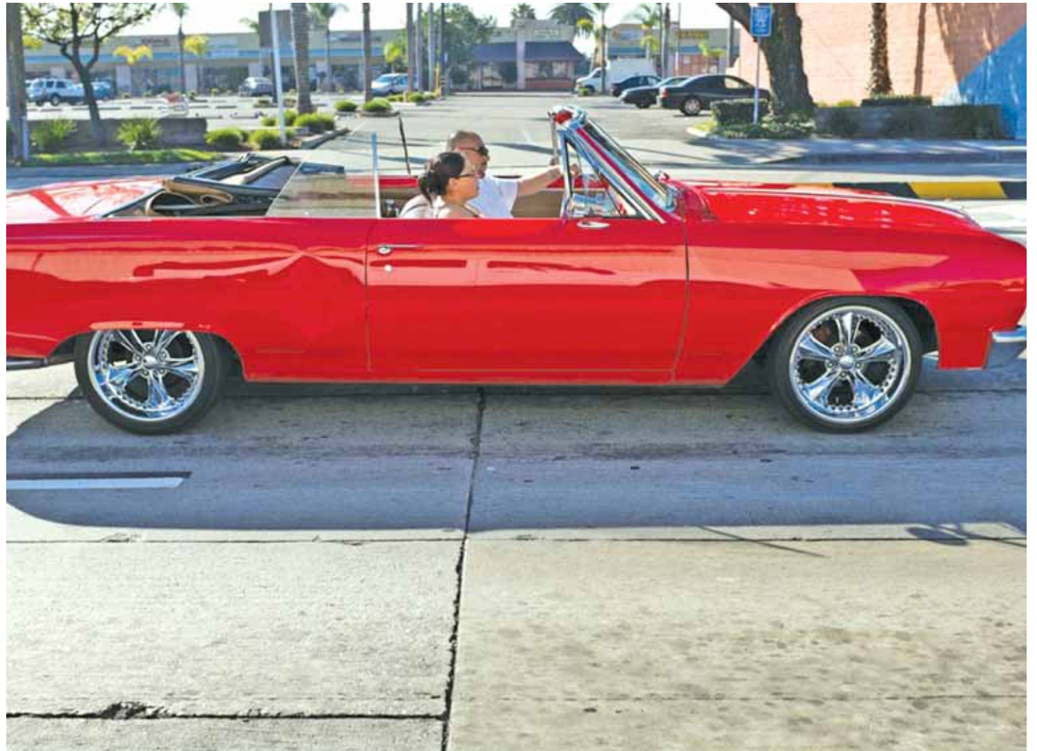
Our photographer snapped this shot of a couple cruising down El Segundo Boulevard in a gorgeous classic convertible Malibu.