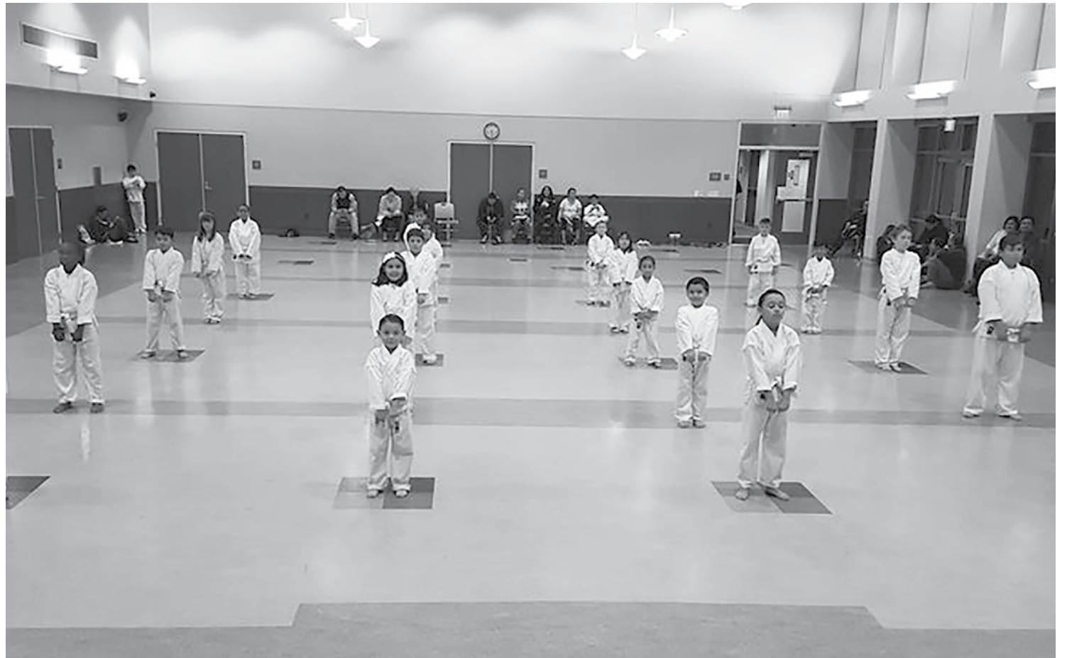
The kids from the Little Dragons class (ages 5 to 10) show amazing discipline during a recent class at the Lawndale Community Center.