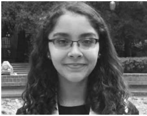
A high school senior from Inglewood who attends Da Vinci Science School in Hawthorne