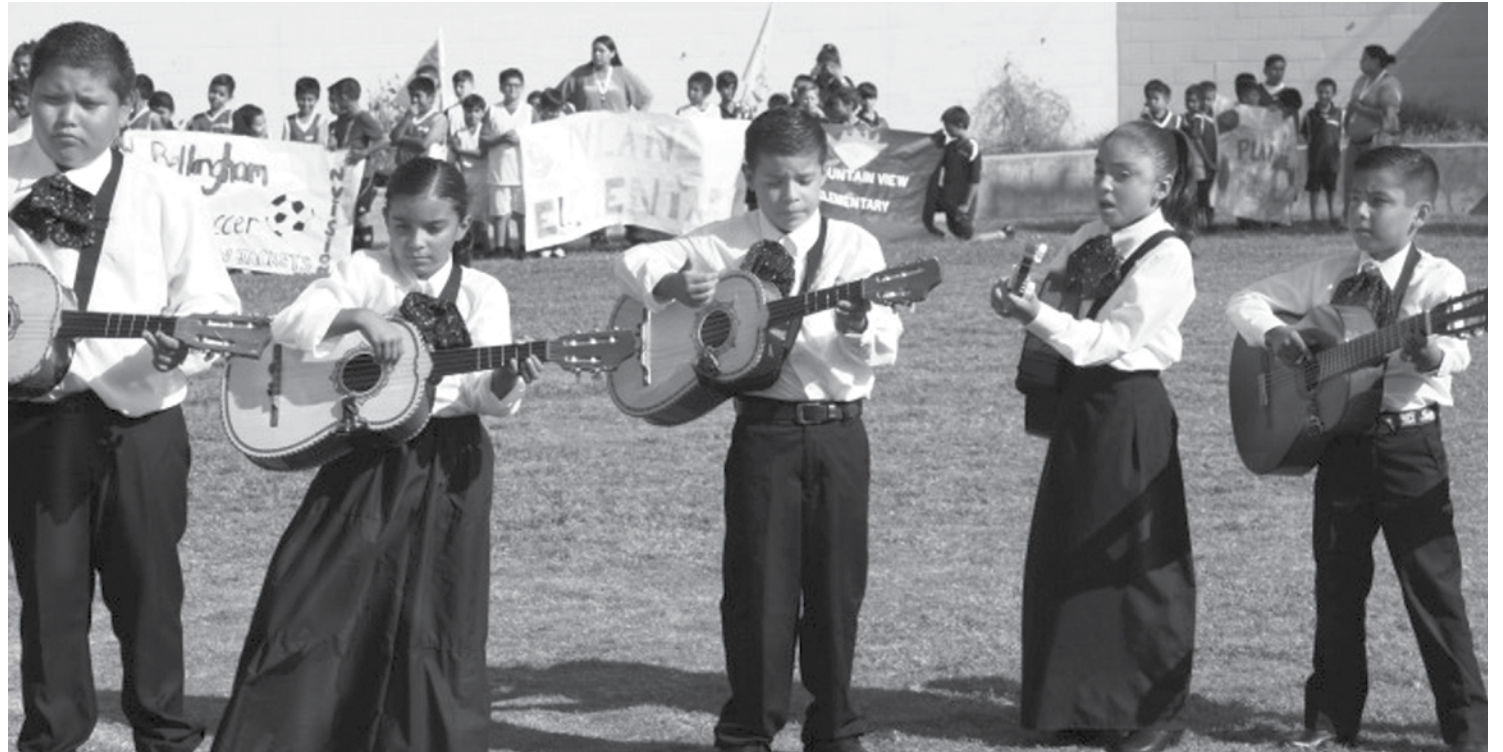
The Los Angeles County Arts Commission has awarded The Community Impact Arts Grant to Woodcraft Rangers. The grant will provide funding for Woodcraft's mariachi and folklorico programs and their performing arts competition, Spirit Jam. This grant will allow the 94-year-old organization to expand its already amazing mariachi and folklorico programs into other schools. Woodcraft Rangers is a nonprofit organization serving the youth and communities of Southern California.