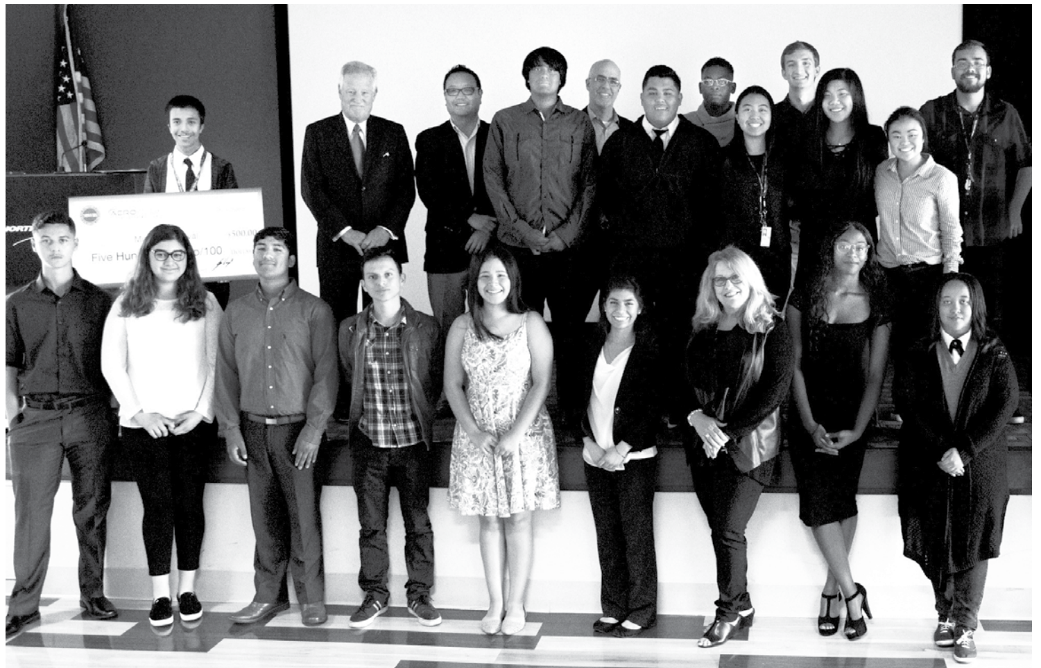
The South Bay Workforce Investment Board (SBWIB) and its Aero-Flex Pre-Apprenticeship partners recently welcomed the first graduates from Northrop Grumman's Spring 2017 HIP (High School Involvement Partnership) program. Among the 23 youth enrolled in Northrop Grumman's HIP program, 20 enlisted in SBWIB's pilot "earn and learn" Aero-Flex Pre-Apprenticeship in Engineering.