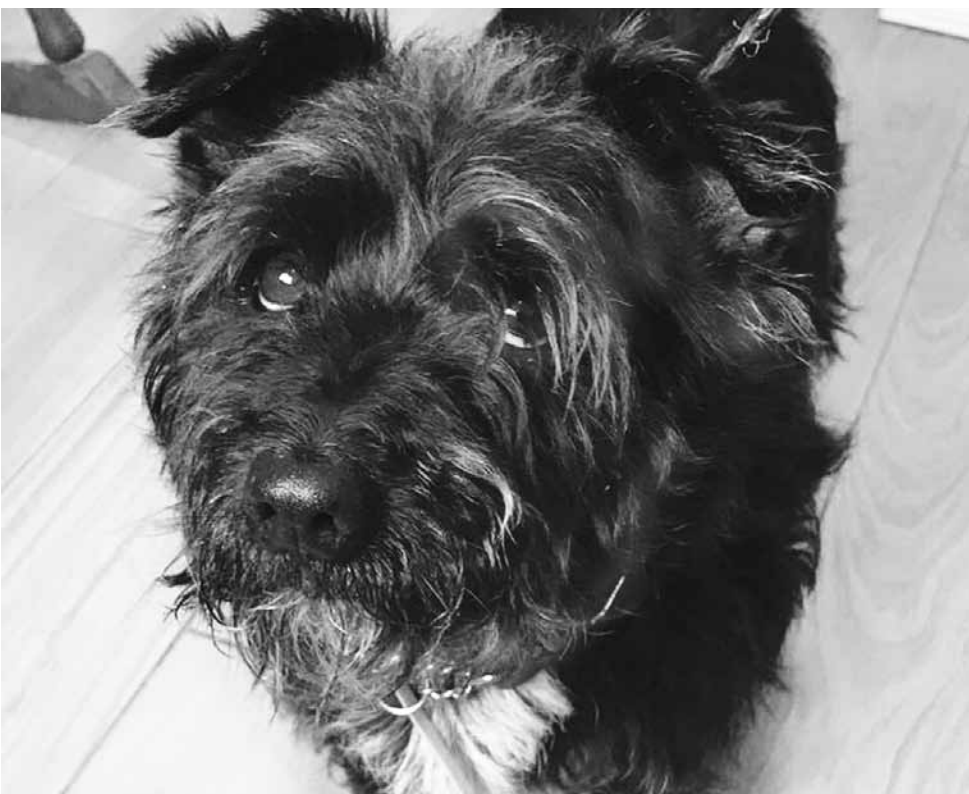
Have a fantastic time with your new family Ferguson!

Congratulations to Ferguson , our adorable Scottie/Schnauzer who was rescued a couple of weeks ago, and his new family. His new family previously owned a Schnauzer and they had recently lost their Scottish Terrier to cancer. When they met Ferguson, it was serendipity! His new family also consists of