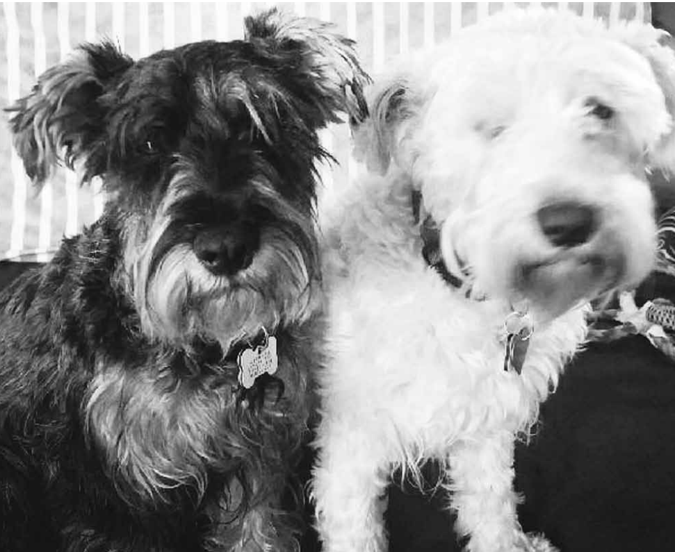
Congrats to mother and daughter, Bette and Joan finding their way to a new home together!

Congratulations to Bette and Joan, our mother and daughter rescues, and their new family. We are thrilled that we were able to place these ladies together because, unlike their namesakes, they are deeply bonded. Their new family, who lost their 17-year-old Miniature Schnauzer a little over a year ago, was ready to open their hearts to a new little gal. When they met these two, they decided to give it a chance. Bette, now named Georgia Mae, and Joan, who is called Piper Rose, live with their mom, their human brother and a grandmother in North Redondo Beach. With all of this love and attention to go around, there will be lots of cuddling in their future. Wishing everyone much happiness and many wonderful adventures!