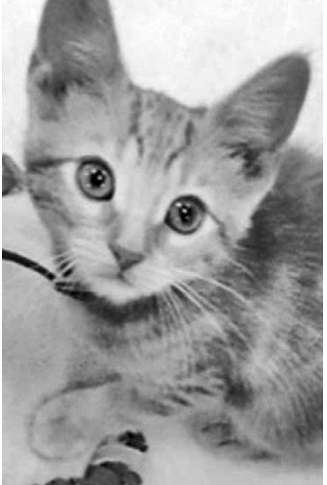
Cerise is smart and cute

Cedar has beautiful markings that make her almost look like fine wood grain. She is a petite kitten who just wants to be loved and played with. She is super sweet and we think of her as the "baby" of the litter. But make no mistake there is a quiet fierceness to her that gives her confidence. Cedar needs