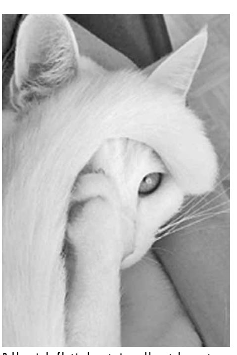
Babbage is deaf but is also outgoing and loves to hang out.