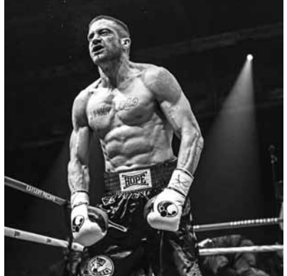
Jake Gyllenhaal in Southpaw.

The film is an impressive turn from director Antoine Fuqua, himself in a commercial