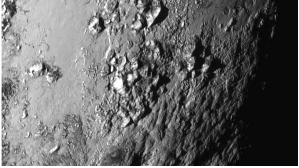
New close-up images of a region near Pluto's equator reveal a giant surprise -- a range of youthful mountains rising as high as 11,000 feet (3,500 meters) above the surface of the icy body.