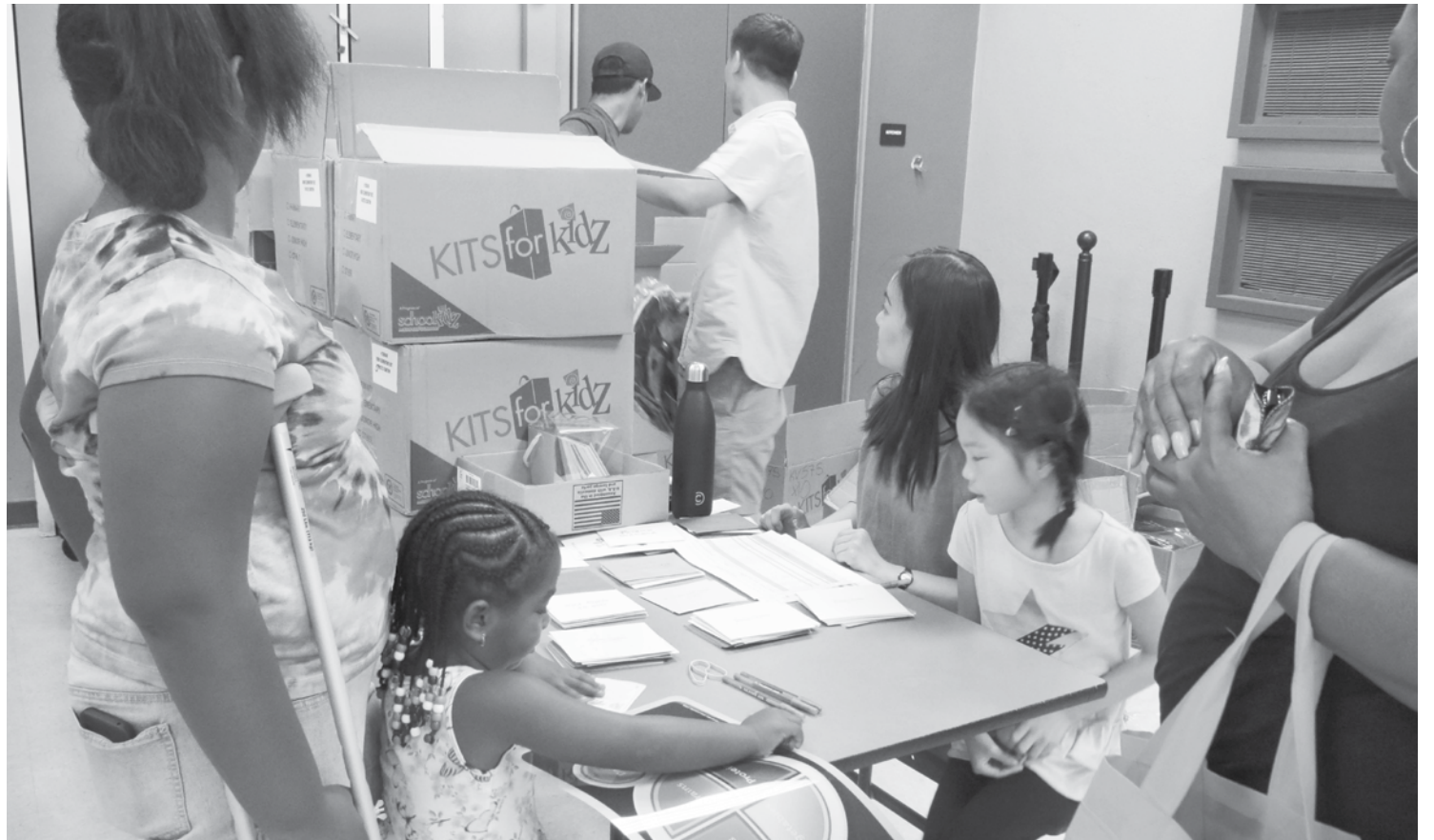
Students and families identified as homeless or economically disadvantaged were personally invited to attend Lawndale Elementary School District's "Back to School Backpack Drive" to receive school supplies and referrals for much needed services. LESD partnered with the Lawndale Rotary Club, South Bay Mission Church, Torrance Memorial hospital, South Bay Children's Health Center, Champions for Change, and Skechers to host two backpack drives to provide students with backpacks full with school supplies, health screenings, nutrition education, clothing and shoes.