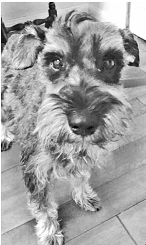
Harper is in need of a kind family of his own.

We are looking for volunteers to help with our pet adoption fairs which are held every Saturday at the Petco located at 537 N. Pacific Coast Highway Redondo Beach 90277, from noon-3: 30 p.m. If you are interested in volunteering and can commit to at least one Saturday a month, please contact us at info@msfr.org. You can also visit all of our Miniature Schnauzers & Friends rescues at the adoption fair or check out our website, www.msfr.org. If you have any questions about a particular dog's availability you can email us at info@msfr.org. Schnauzers! Bet you can't adopt just one!