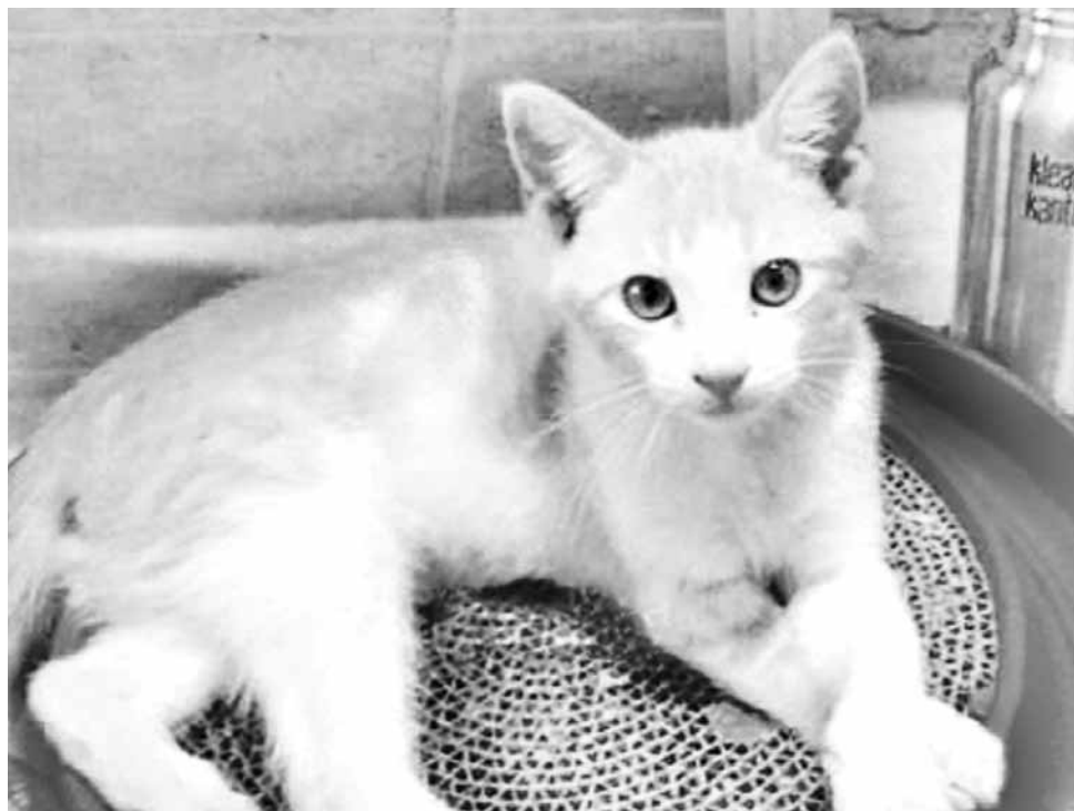
Casanova prefers a home with other kitties.

wrestling until he's panting. Telly is a cuddling maniac. Unless of course, he is in the midst of a life or death chase with a little piece of crumpled up paper -- yes, he is that easily pleased with a simple, small ball of paper and will carry it around until it basically falls apart -- at which point you just have to crumple up another post-it note. He does love climbing as well and is a bit of an escape artist. He will be a great little dear to you and your family