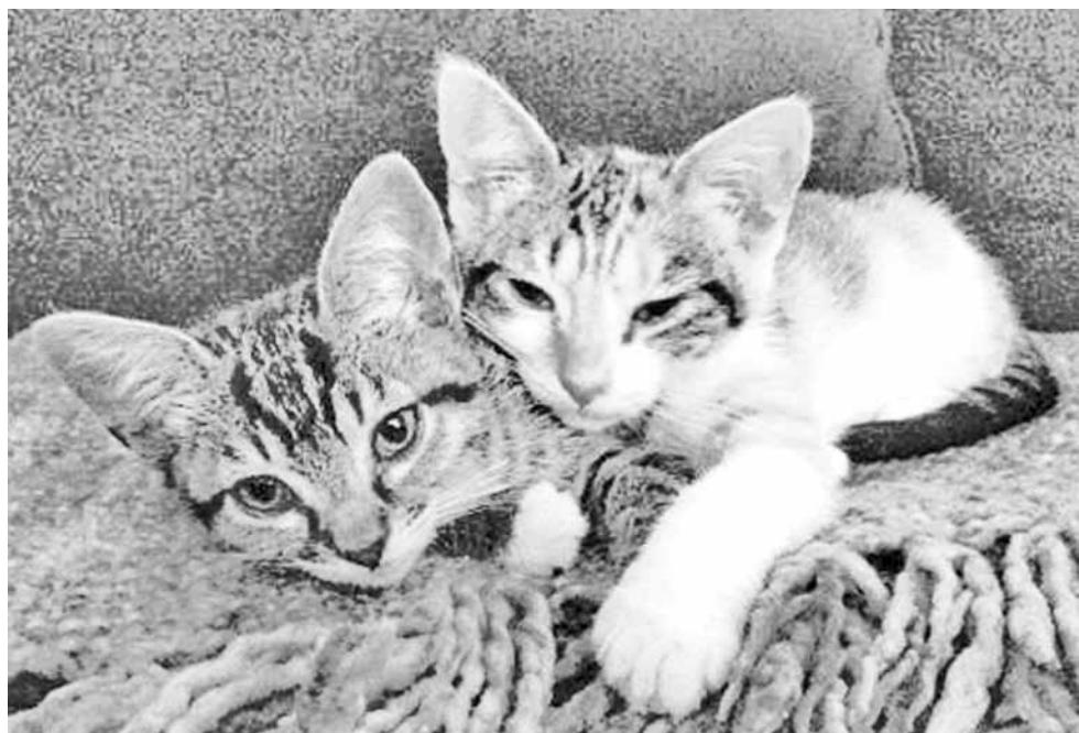
Zena (left) is a playful little chirpy kitten. Juliette has a sweet nature and loves to snuggle.

Be kind. Save a life. Support animal rescue.