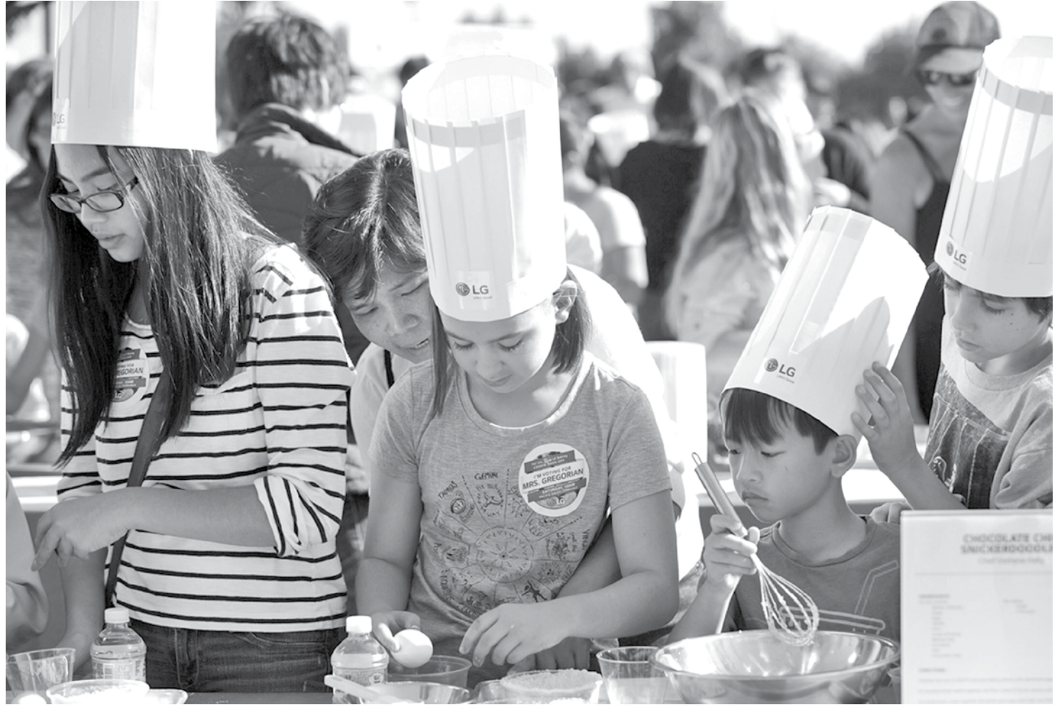
Elementary students participated in the LG "For the Love of Baking" bake-off, held November 14th at Pacific Sales Kitchen in Torrance. Winners received $5,000 for the school of their choice, and LG also donated $5,000 to the charity No Kid Hungry.