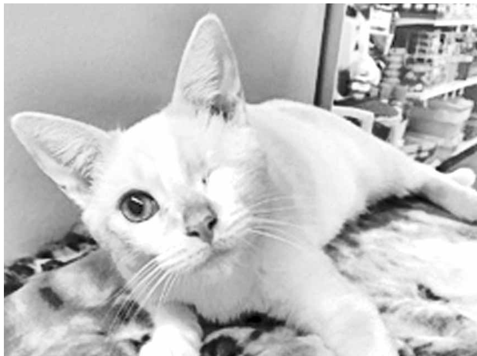
Frissy is a flame-point Siamese who needs a calm environment.

Looking for your purr-fect match? Kitties of all colors and sizes are ready for their forever home with you.