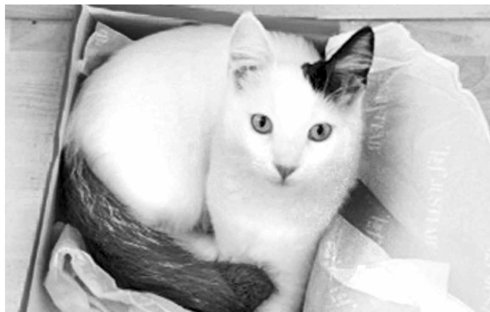
Telly loves to play!

Telly is the most unimaginably soft little fluff you have ever touched and his character is just as unique and special. Seriously, he's like petting a cloud. He is a consummate explorer and adventurer. "Play 'til I drop" is most assuredly his motto; running and