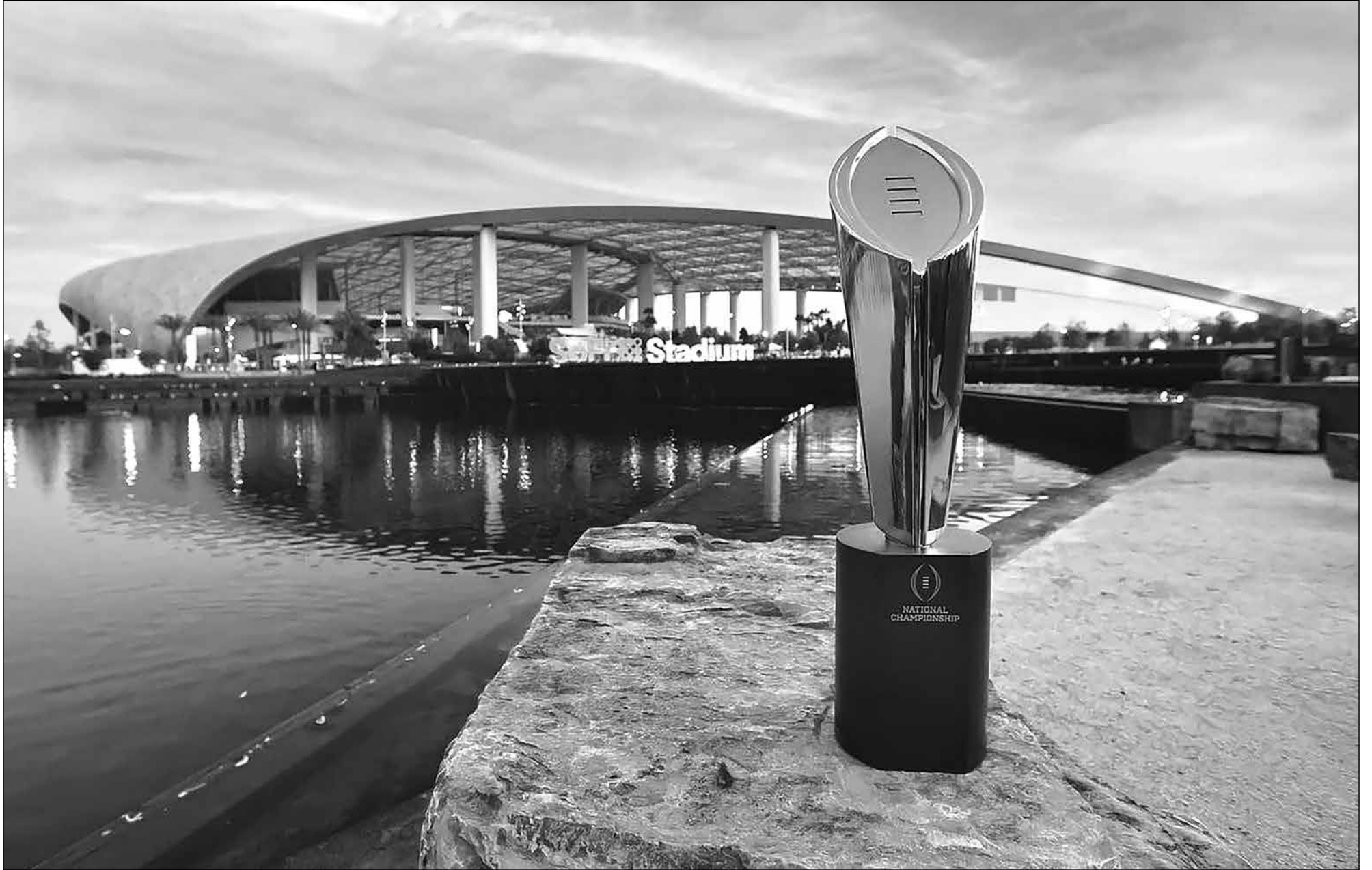
Less than a year after Super Bowl LVI, SoFi Stadium will host the College Football Playoff National Championship on Jan. 9, 2023.