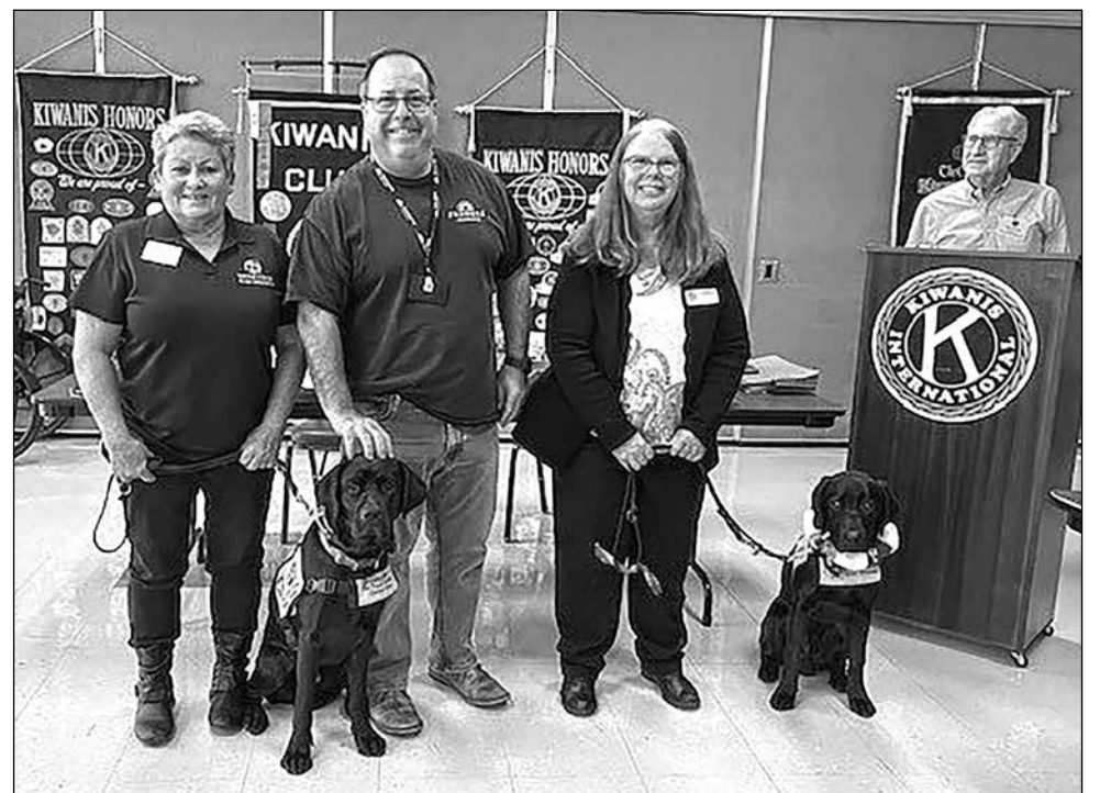
Pups in Training