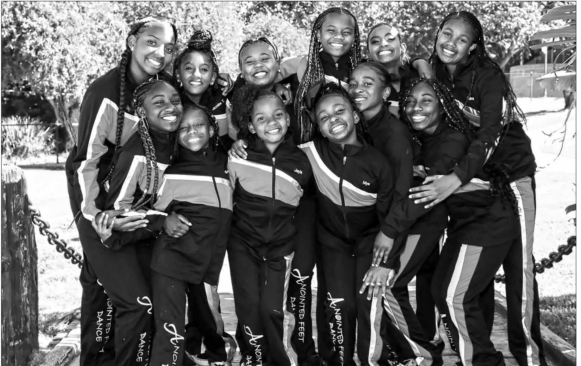
Anointed Feet Dance's vision is to build stronger communities through the art of dance, strengthen the overall cognitive and physical health of every dancer and to create an environment that encourages dancers to pursue higher education. Please support our local businesses.