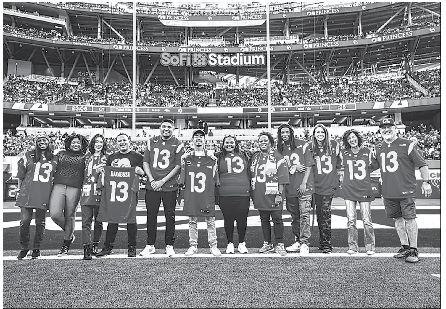
As part of the pLAYmakers program, the Los Angeles Rams selected 13 Los Angeles community members that exemplified leadership in advocating for justice, addressing disparities and inspiring change and recognized them at SoFi Stadium during the LA Rams versus Denver Broncos matchup. Thank you to all the playmakers who give back to our community.