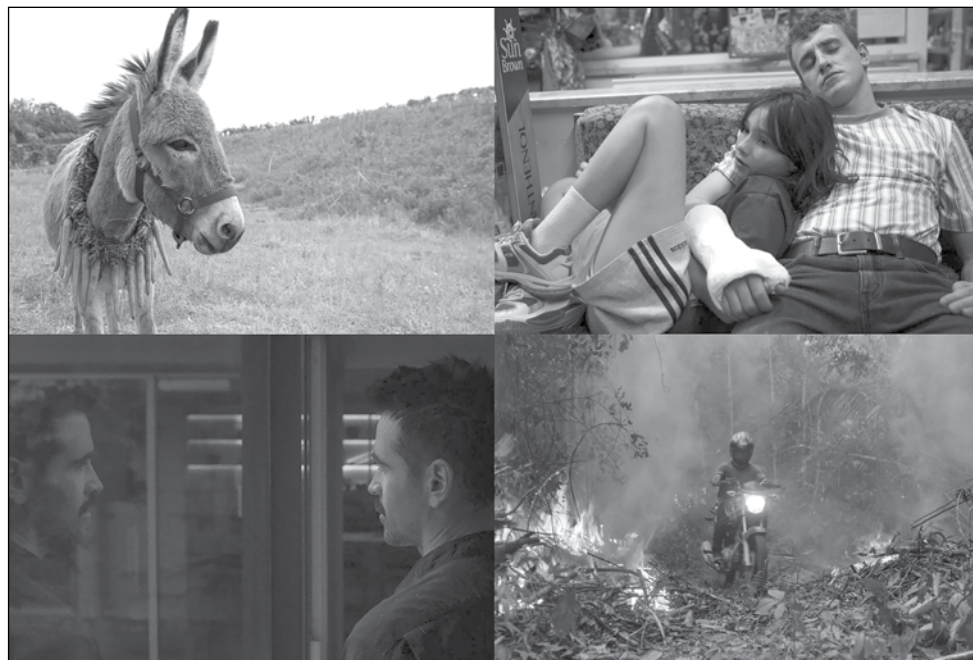
Clockwise, from top left: EO , photo courtesy of Janus Films. Aftersun , photo courtesy of A24. The Territory , photo courtesy of National Geographic. After Yang , photo courtesy of A24.