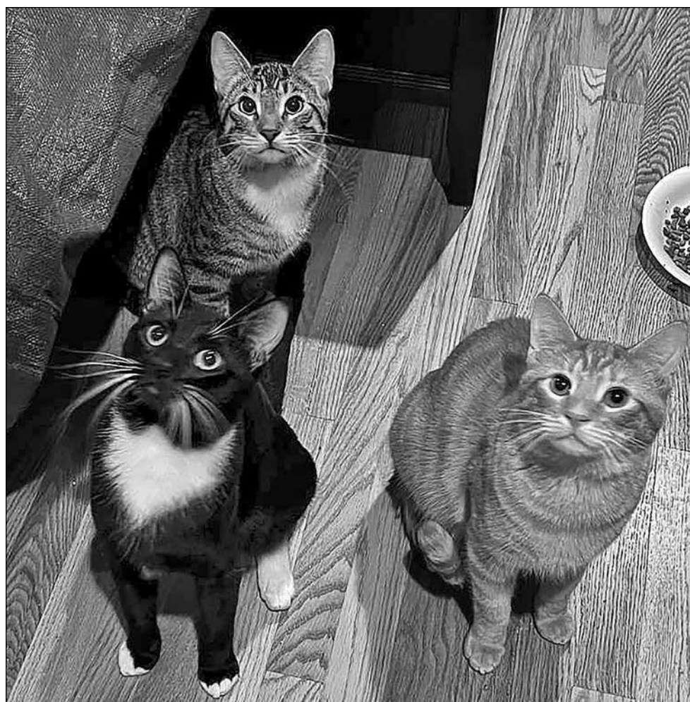
Turner (right), MoonKnight (left) and Checo (top left)

Saving one animal won't change the world, but the world will surely change for that animal. •