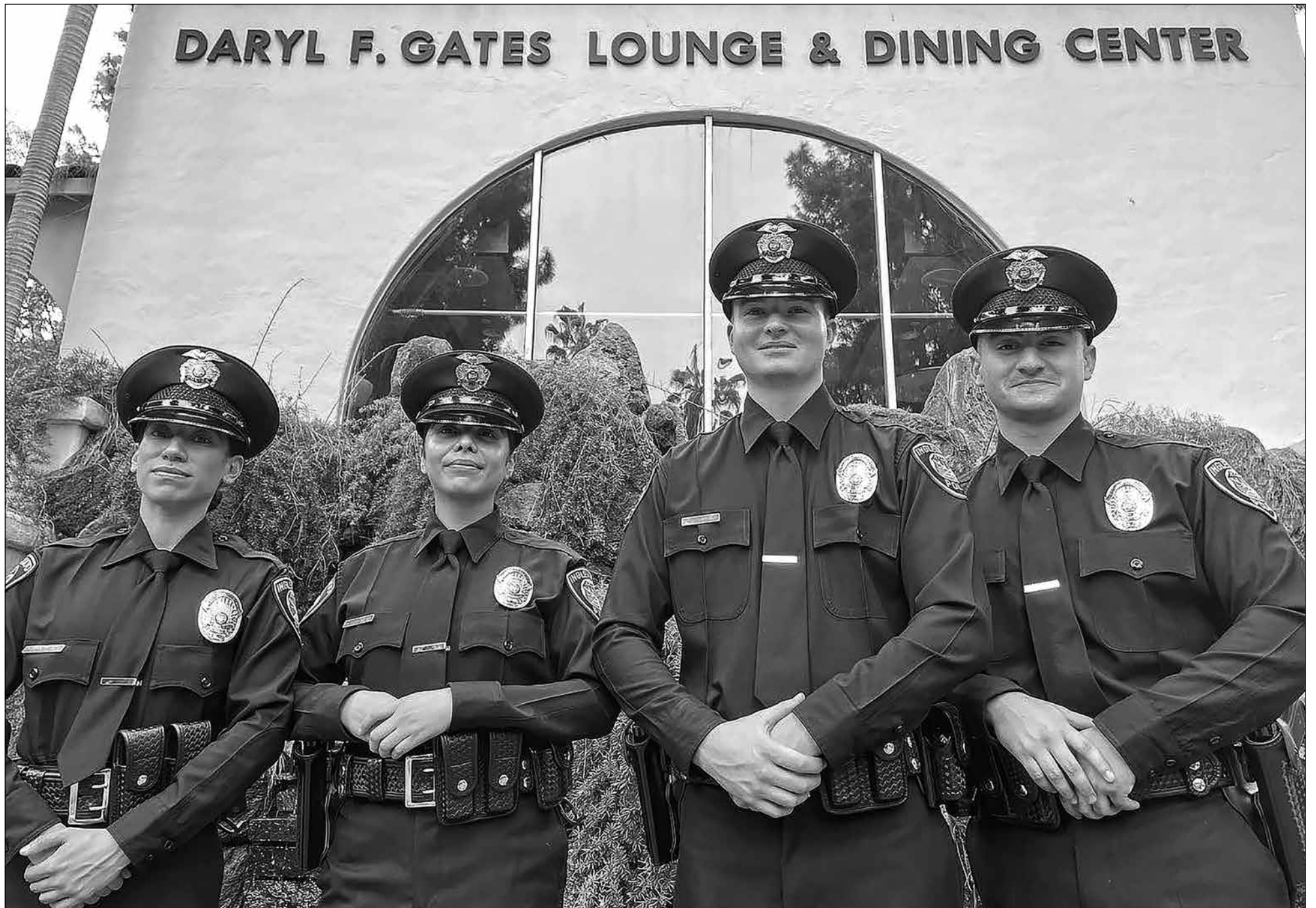
Congratulations to our four recruits for receiving their badges.