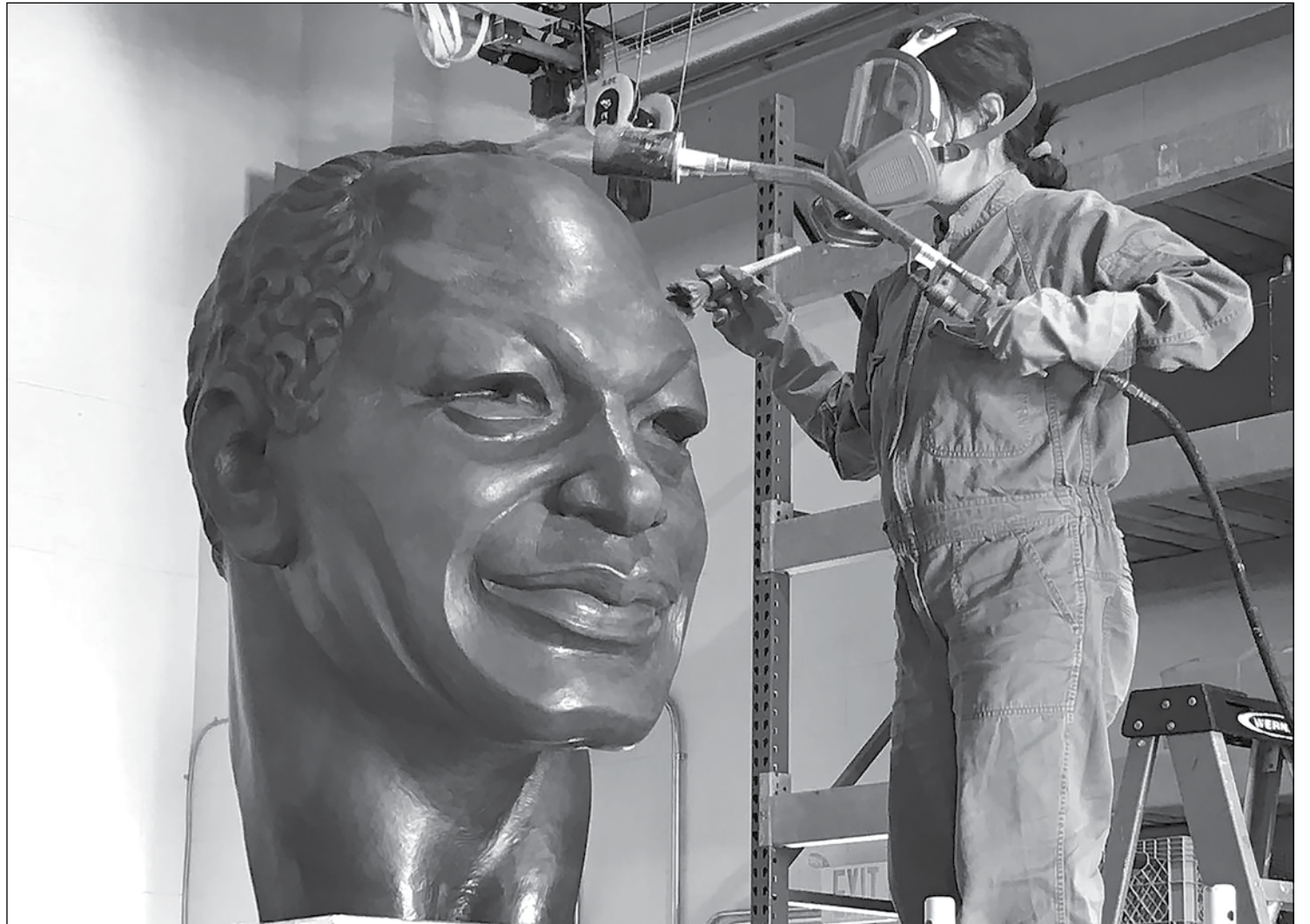
The LAX Art Program welcomes the bronze bust of Mayor Tom Bradley back to Tom Bradley International Terminal after being removed in 2020 due to construction in anticipation of the Automated People Mover. The sculpture was created by artist Serge Sarkis and gifted to LAX in 1987 by Mayor Tom Bradley. Located at the entrance of the terminal, the sculpture had greeted international travelers to Los Angeles for over 30 years. The sculpture has undergone conservation and care by the teams at Modern Art Foundry, Carnevale & Lohr, and Sculpture Conservation Studio, and will be installed in its new location within the terminal in late 2023, ready to once again welcome the world to Los Angeles.