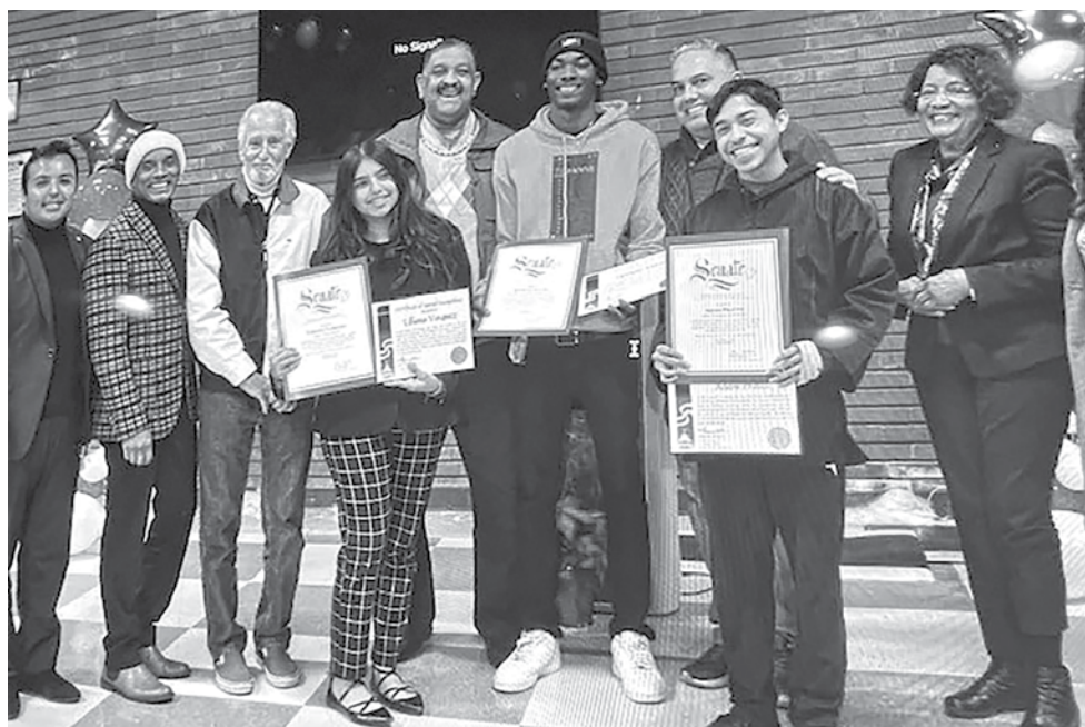
Hawthorne Teen Center Awards

So, now do you feel a little better about the future of our South Bay? It is very reassuring to see what the Workforce Board has done and is continuing to get done. All right then, I will say, "May the Workforce Be with You!" •