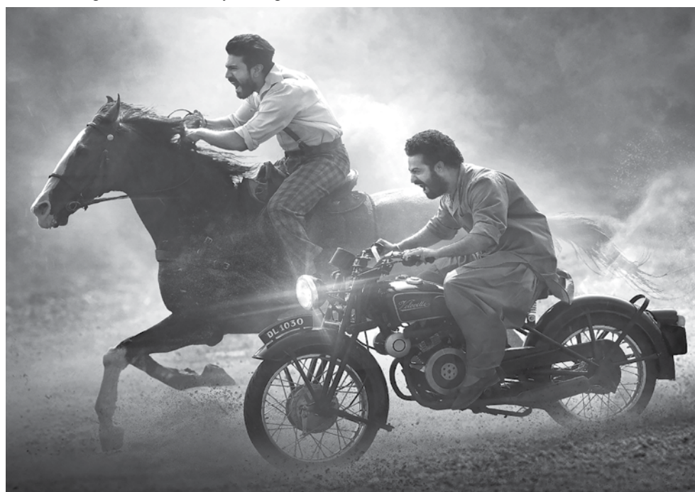
RRR

So, who is RRR for? It's certainly for fans that want to see a single man defeat an entire mob of mercilessly angry protestors by himself. Or, see a man capture a lion with his bare hands. Or both of those men ride a horse and motorcycle and leap headfirst into battle while explosions ignite behind them. Or, to see both of those men do the best dance sequence of last year ("Naatu Naatu" is likely the lock for Best Original Song at