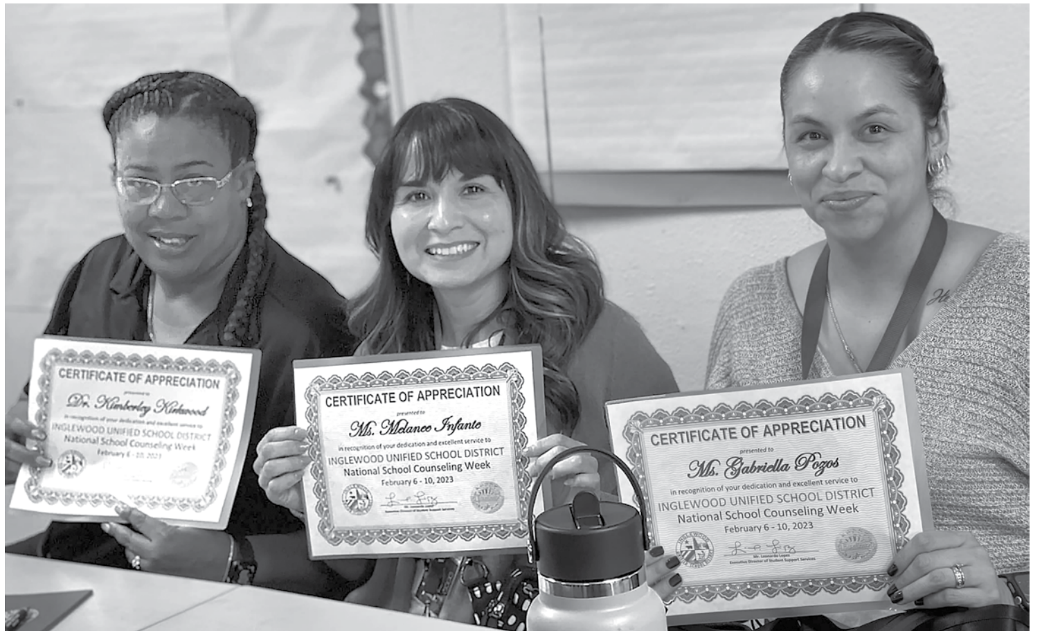
In honor of National School Counseling Week, our Student Support Services department recognized our amazing school counselors. We are extremely grateful for the significant impact they make in the lives of our students every day.