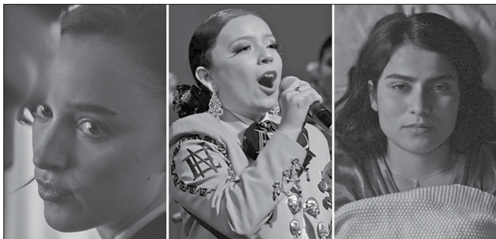
(From L-R): Fair Play , Going Varsity in Mariachi , Fremont .

Fremont is a coming-of-age film that I fell deeper in love with the longer I watched it.