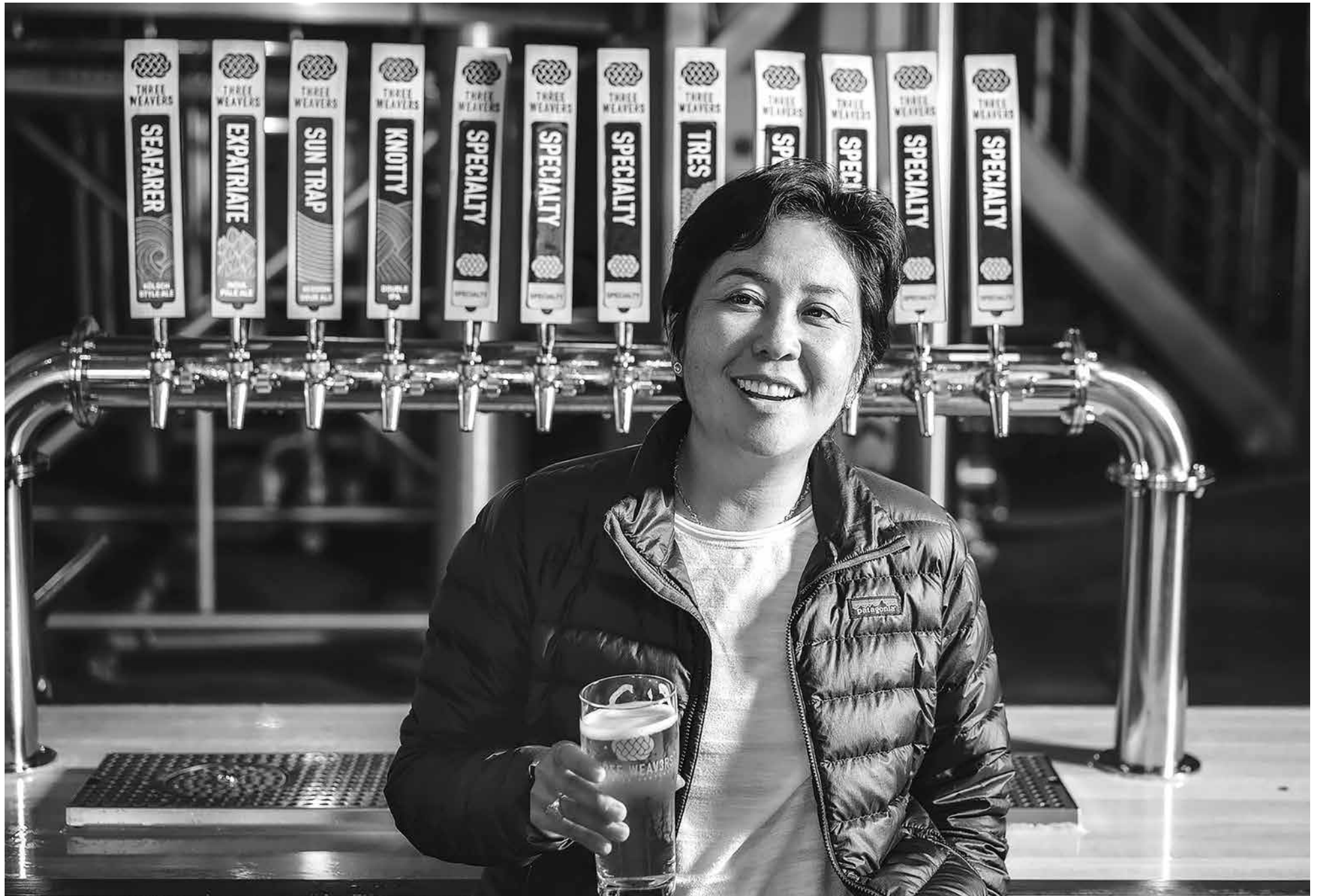
Three Weavers Brewing Company is set to open their second location, Three Weavers GRDN, in Hollywood Park's retail district. Originating on the east side of Inglewood in 2013, Three Weavers has become one of LA county's largest independent breweries. With people flocking from the neighborhood and all over to sample their core and seasonal beers, Three Weavers has become a popular staple in the Inglewood community. Please support our local businesses.