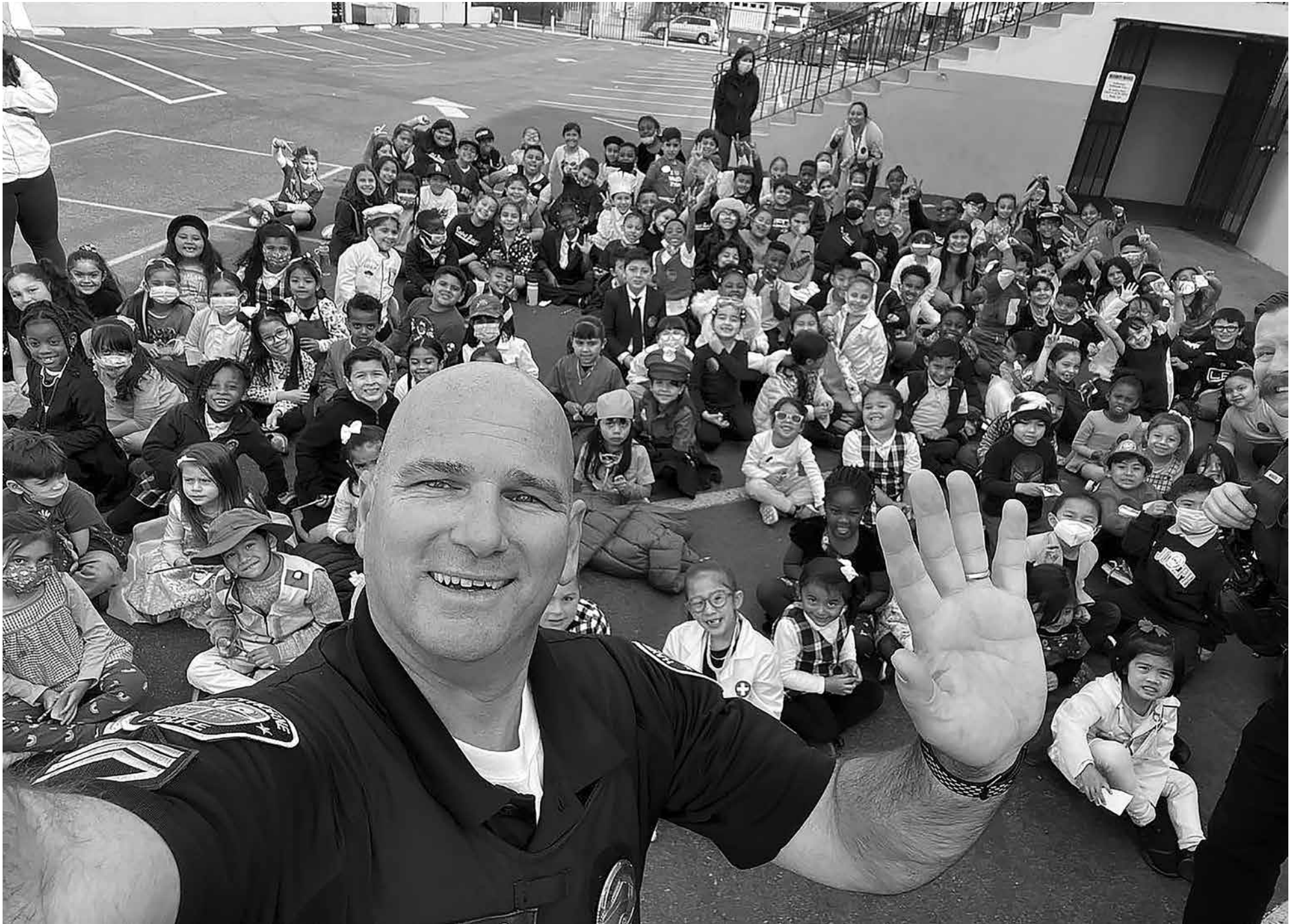
Saint Joseph School invited the Hawthorne Police Department to their career day. They had an awesome time talking with the kids and Gabby the Talking Police Car was excited to see the students again.