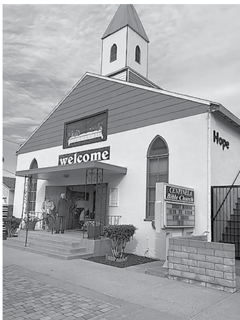
Centinela Bible Church