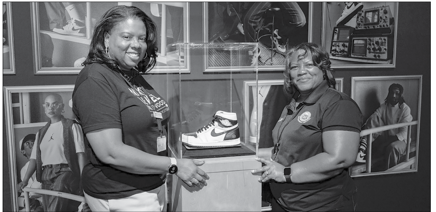
It was an honor to welcome the Jordan Brand House to our community during All-Star Weekend. Our Inglewood students got the first look and the opportunity to be inspired right here at home. Another incredible moment in the books.