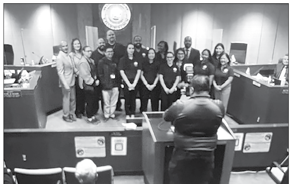
Honoring City Staff.