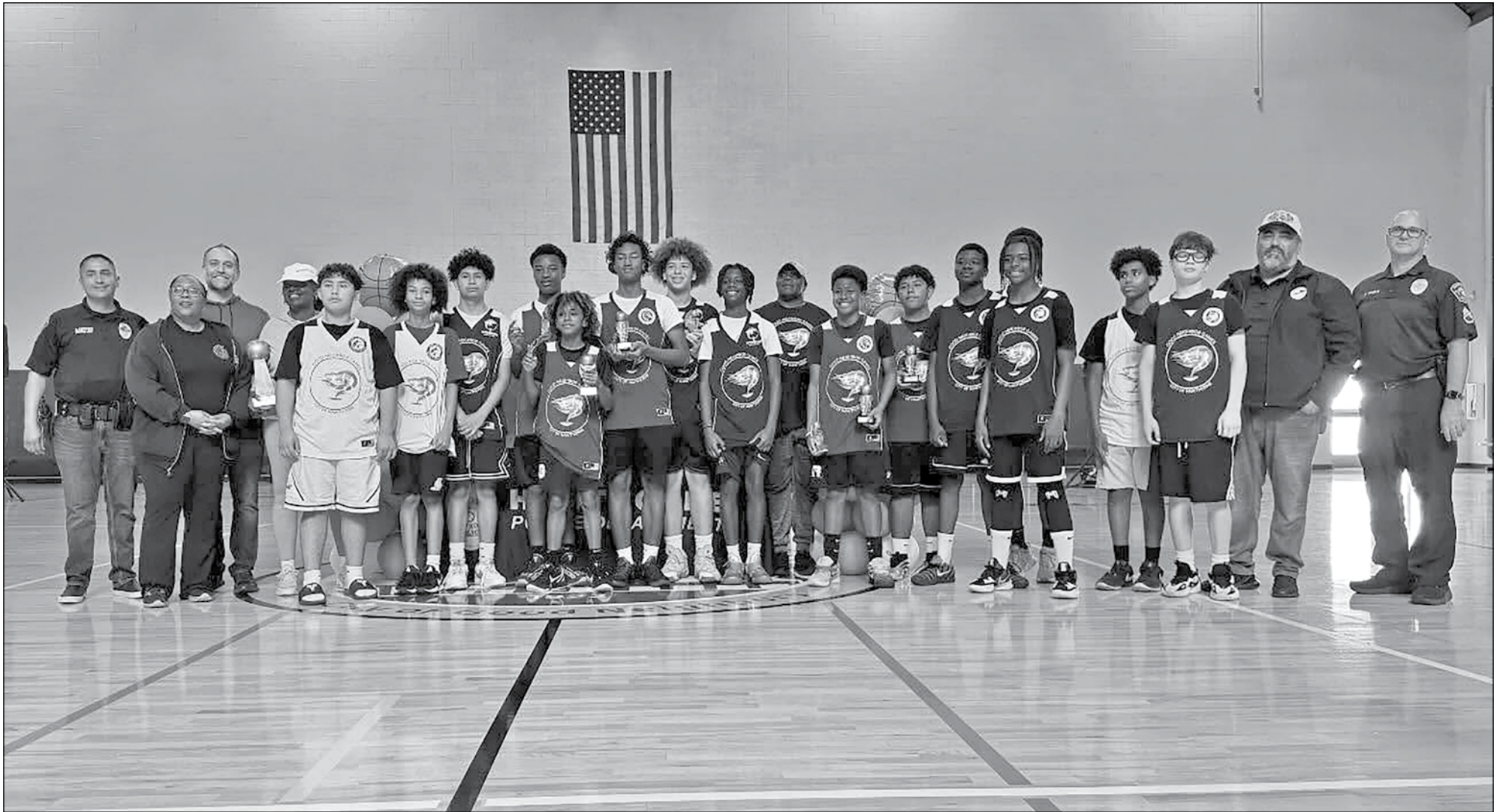
For sixteen weeks the Hawthorne Police Department visited both the Hawthorne and Wiseburn middle schools in preparation for the games. We'd like to congratulate Hawthorne Middle School for coming in 1st Place, Bud Carson placed 2nd, Wiseburn came in 3rd, and Prairie Vista Middle School came in 4th. All of the kids really gave it their all. Thank you to everyone who participated, showed up to cheer the teams, and to our sponsors who made this event possible.