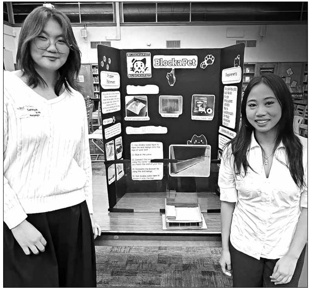
Students from CTE pathways and elective classes, including engineering, media arts, visual arts, and culinary arts, pitched creative solutions to real-life problems, from messy school bathrooms to cats hiding under the bed. Foods 1 and 2 students also competed in a snack challenge, with winners like the "All in One Breakfast Cups," while creative students showed off their photography and logo design. Upbeat student emcees kept the energy high while industry professionals served as judges. Engineering students even designed the medals awarded to the winners. Invention champions now advance to compete at the district level. We cannot wait to see what they do next.