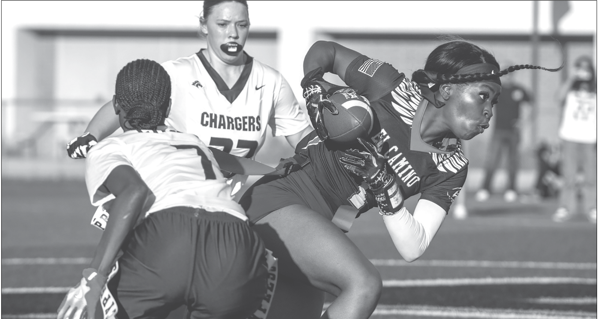
The inaugural team hosted Cypress College in their debut scrimmage. Catch the next home game on March 10 and view the rest of the schedule at bit.ly/FFScheduleECC .