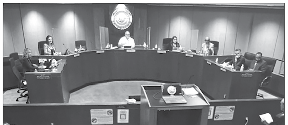
Hawthorne City Council.