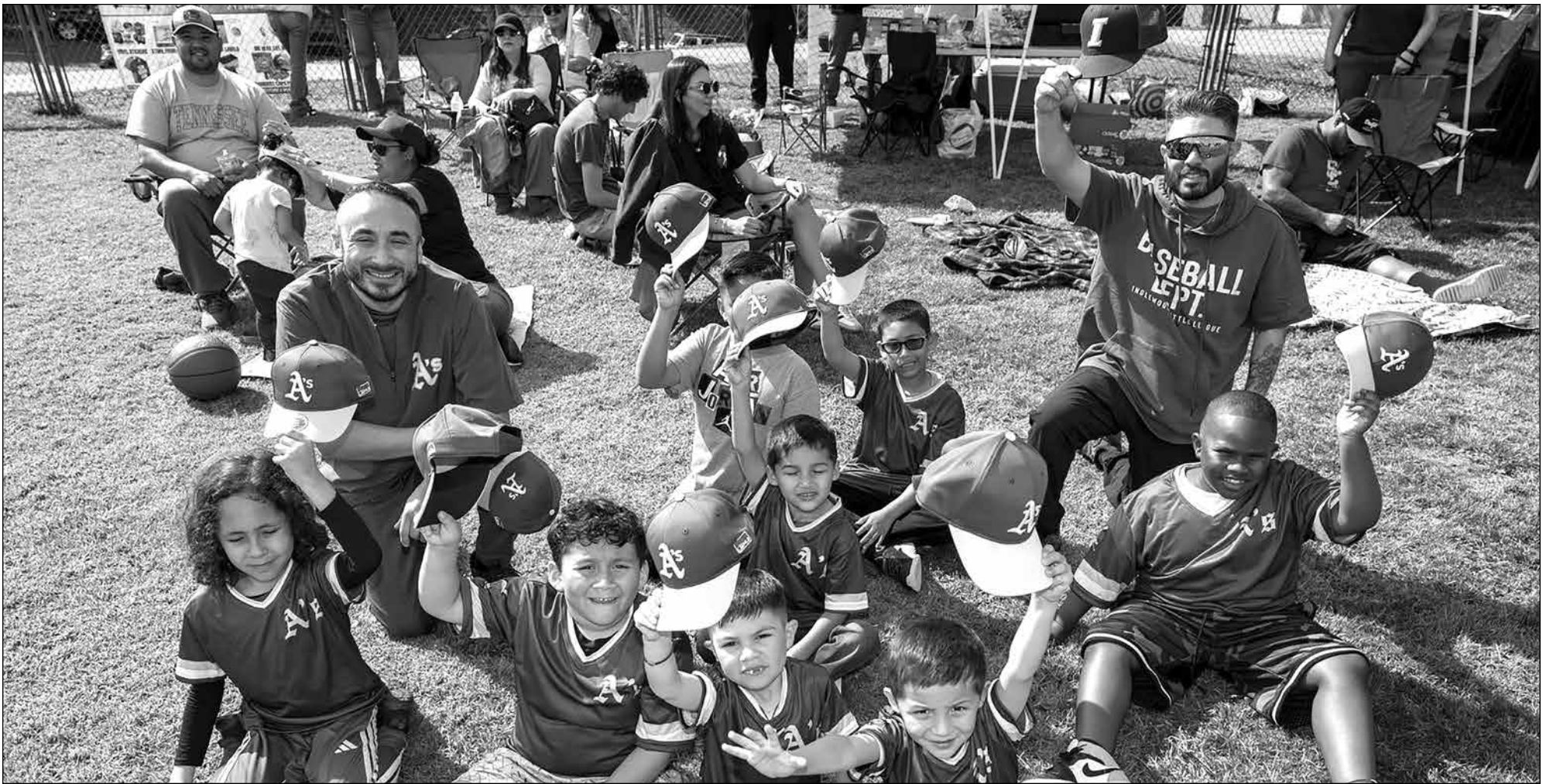
We're so excited to cheer on all of our young athletes as they step up to the plate. Let's play ball, Inglewood.