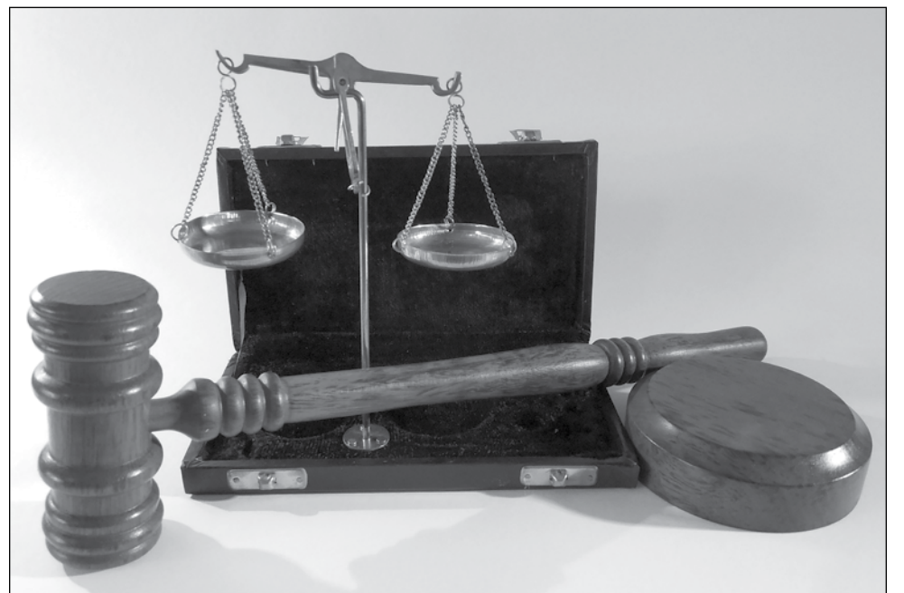
Scales of Justice.