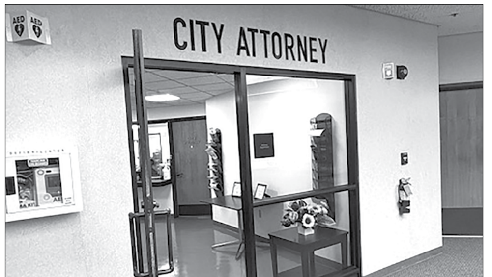
The City Attorney's Office.