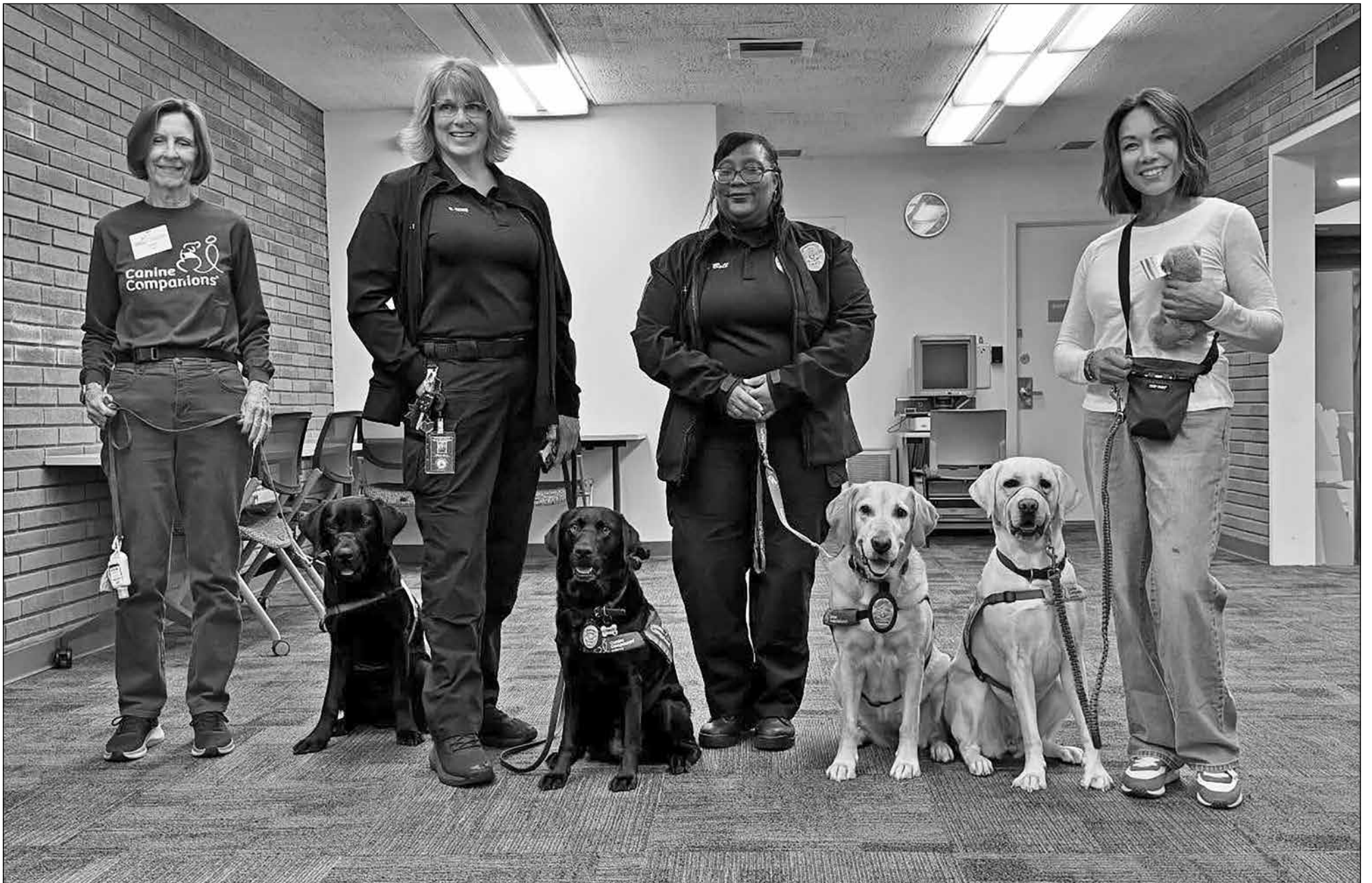
Special thanks to the puppies in training from Canine Companions and Redondo Beach's K9 Cadbury for making a special appearance to the event. The kids were thrilled to meet the working dogs they read about in the book.