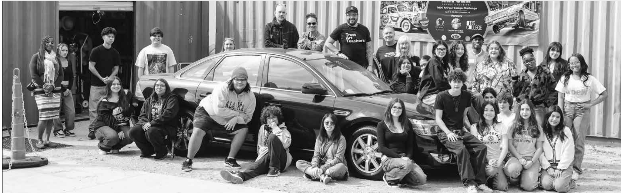
These Da Vinci Design Fine Arts Pathway students are bringing imagination, design and engineering to life through the Art Car Project—an ambitious initiative that transforms a vehicle into a rolling work of art that will be featured in the Annual Houston Art Car Parade and Festival next month. See story below.