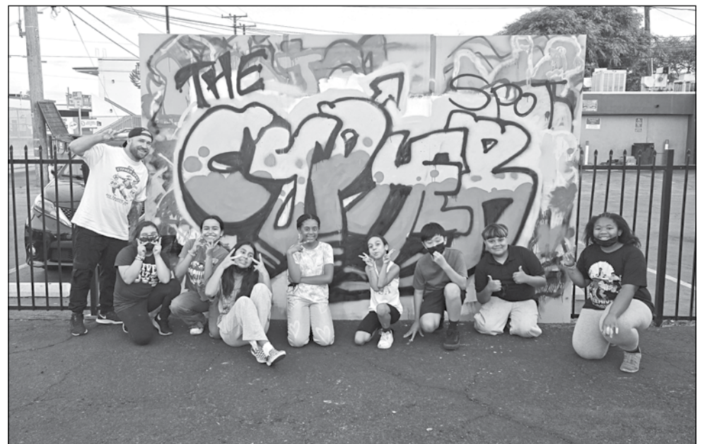
Having Fun!