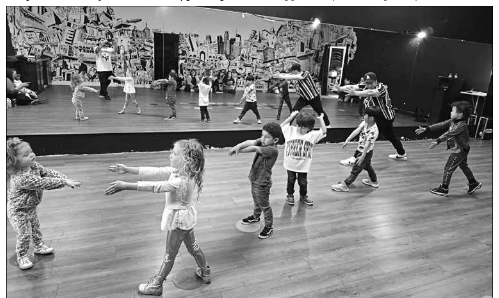
The Cypher Spot.