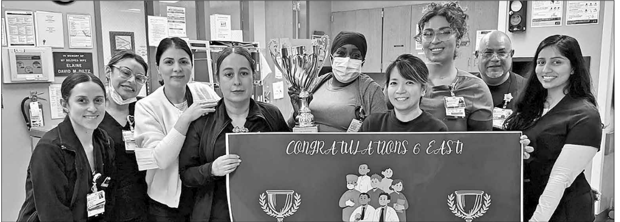
Your dedication to care and compassion is honored by your peers and patients.