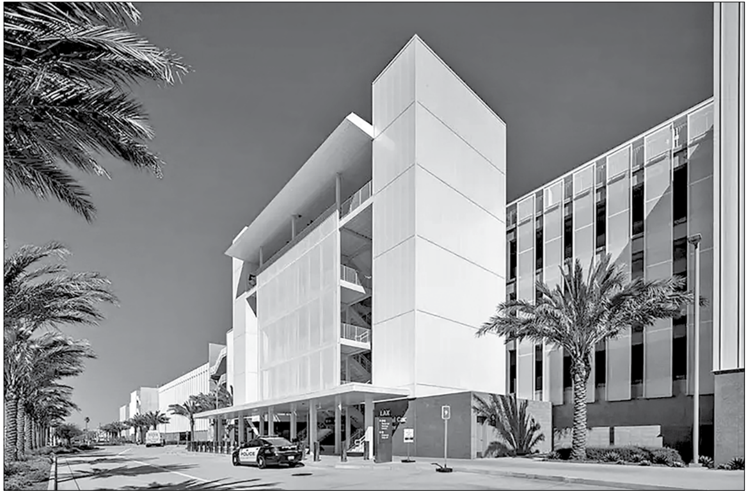
Guests can easily pick up and return cars from on-airport rental car companies in a single location. It's one huge step – 6.4M sq. ft. to be exact – toward transforming LAX and improving the travel experience for airport guests. The LAX Rental Car Center (ConRAC) is located at 5251 W 98th Street.