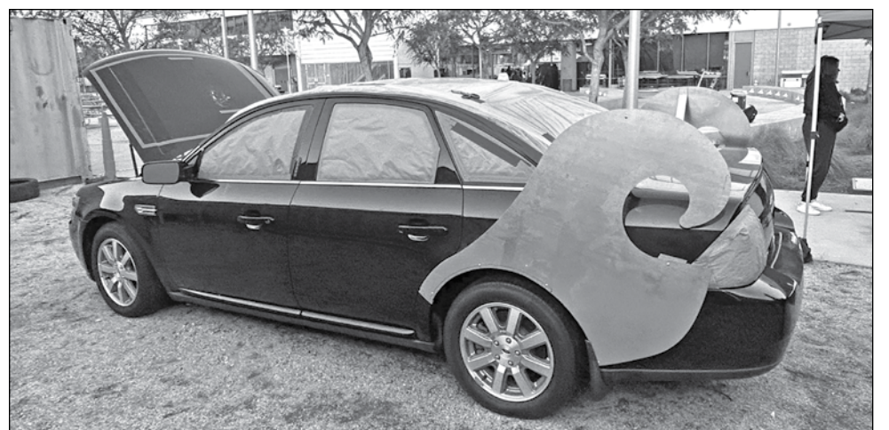
This 2009 Ford Taurus waits in the wings for more additions in its transformation into a mobile masterpiece.