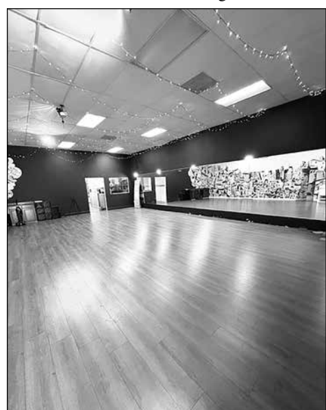
The Dance Studio.

I will close with this quote from the Cypher Spot website: "Our purpose is to create a space where children can learn to create, without the financial stress upon their families that comes with traditional dance and art studios. To maintain our affordable pricing and high-quality teaching, we partner with local churches, the community, and businesses. We are God's family, and everyone should have the opportunity to be a part of it." •