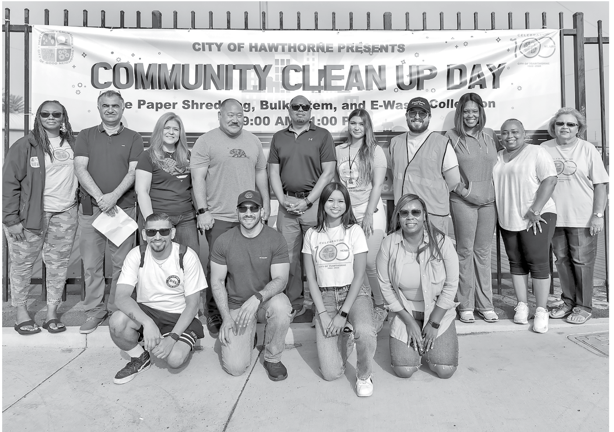
Community Clean-Up Day was held on Saturday, October 8th, 2022. Everyone gathered at the Betty Ainsworth parking lot to sign up and be sent to a specific area in Hawthorne to clean up our City. Big thank you to all that participated and made this event a success.