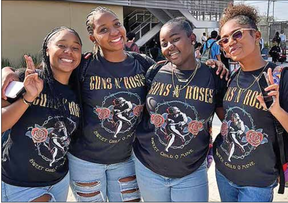
Cardinal ROCKStars looked great with their twins and groups. This was just one of the fun events during Spirit week.