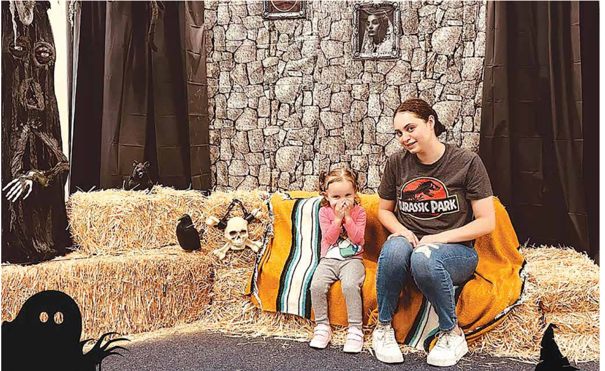
We invite you to come view, take pictures & experience the Pirate Halloween Exhibit & Creepy Halloween Photo Spot at the Main Library. See you there, aye, aye.