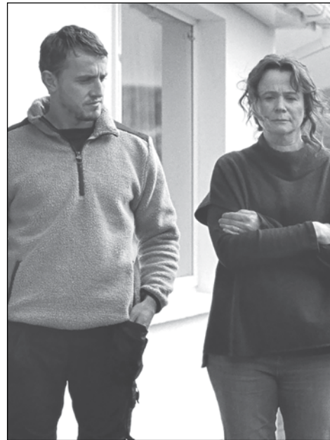
Paul Mescal and Emily Watson star in God's Creatures

The story takes place on the Irish coast. Constantly cloud-filled skies and stormy seas make for tough living conditions. It's what