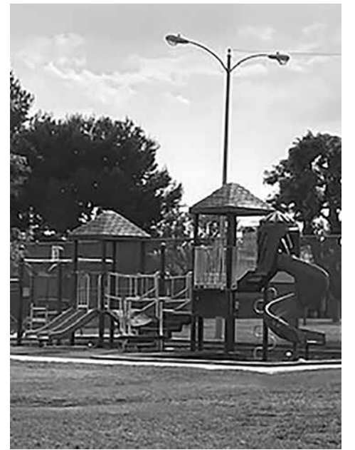
Zela Davis Park