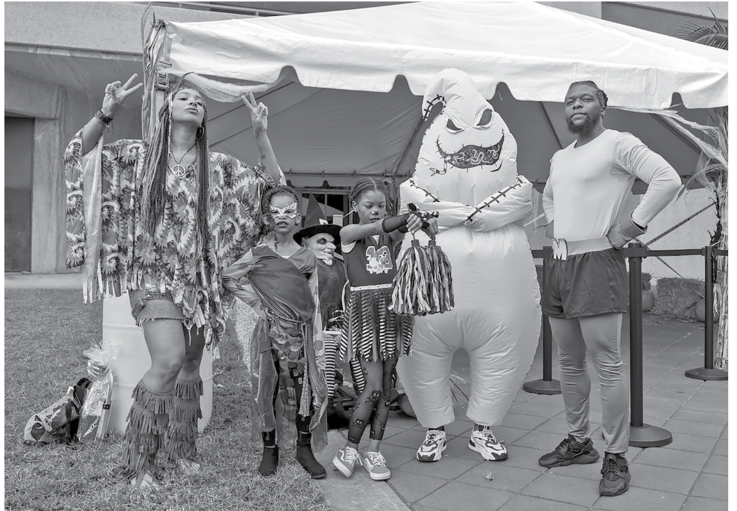
Over the weekend everyone had a SPOOKTACULAR time at the Halloween Family Fest. The Inglewood community kicked off the spooky season with amazing costumes and exciting activities. A huge thanks to everyone who came out. We hope you all have an incredible Halloween, stay safe.