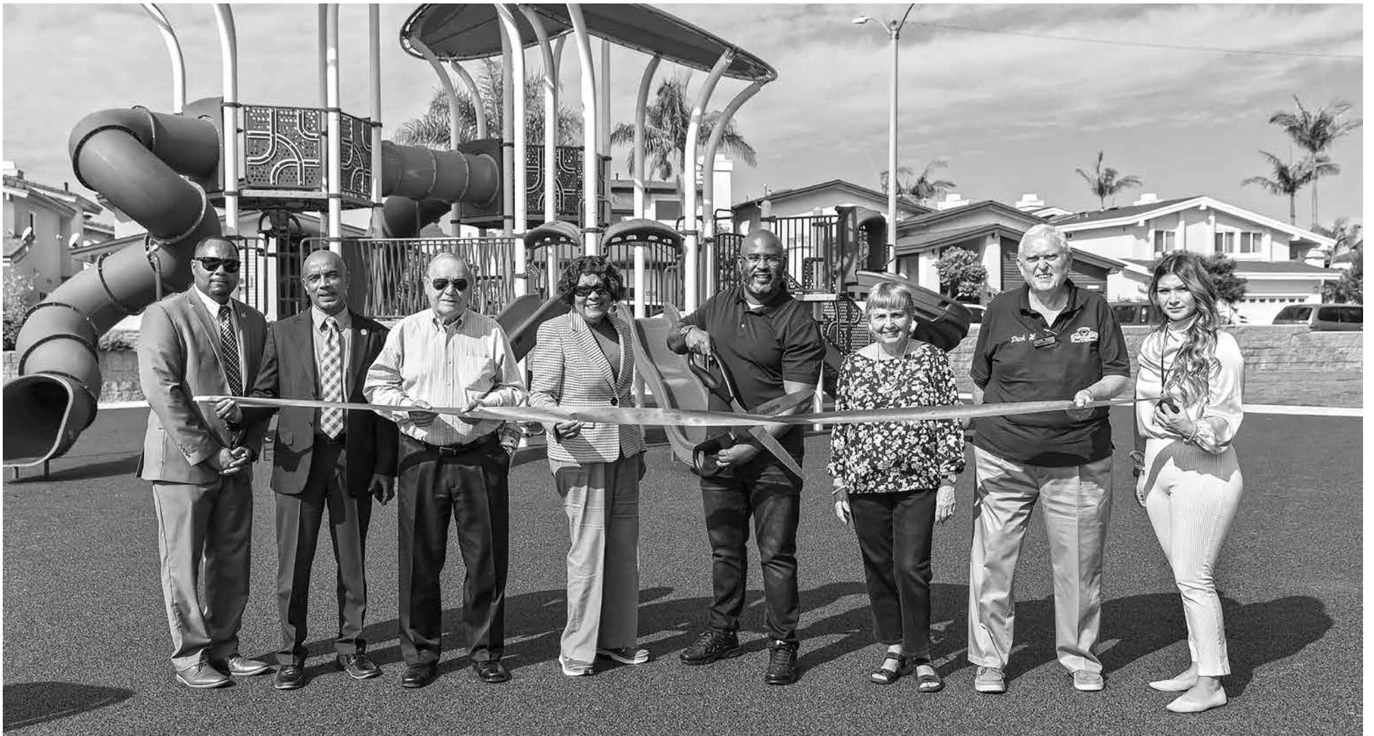
Holly Glen held their much anticipated reopening of the newly remodeled Holly Glen Park. The renovations began in June of this year. Project funding came from Prop 68, Prop A and Development Impact fees. It was estimated to cost $800,000 dollars, and a bit more than half was spent for the play equipment. Thanks to all the residents that came to celebrate with us on this renovation, and there are more parks to come.