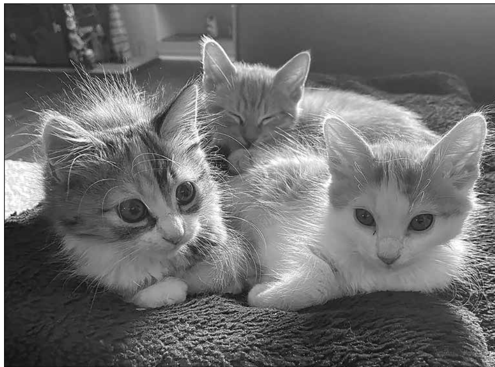
Lamborghini, Maserati and Ferrari

Saving one animal won't change the world, but the world will surely change for that animal. •