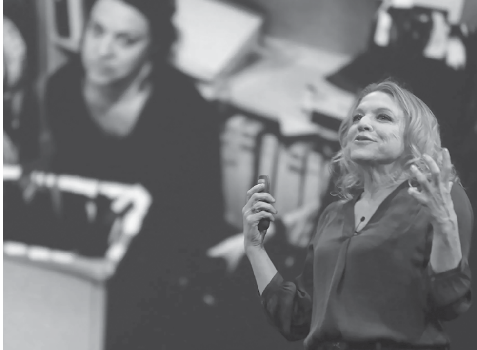
Nina Menkes appears in Brainwashed: Sex-Camera-Power by Nina Menkes.

Using over 175 film clips from Hollywood blockbusters and cult classics, Menkes points out how simple, subtle techniques like framing and lighting can disempower women on the screen. For example, women are countlessly shot in fragmented ways, like close-ups of breasts, hips, and butts while men are usually always shot full body