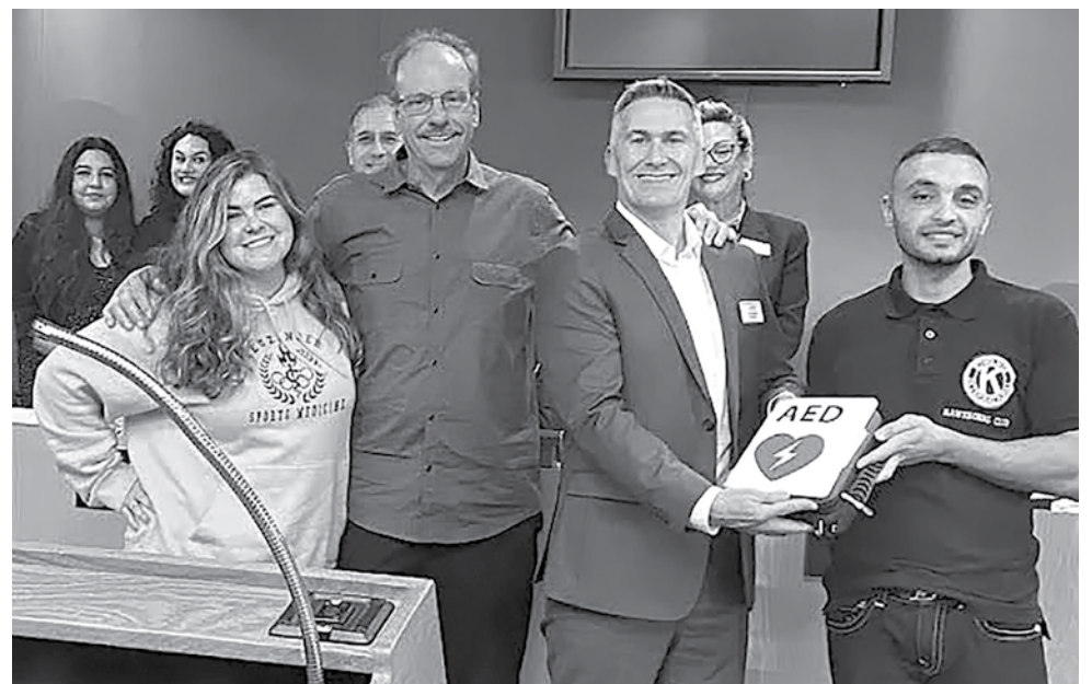
AEDs are delivered.

Along with the Hawthorne Kiwanis Club, some generous contributors that funded one or more AEDs are Imperial Projects, Inc., See Smiling, page 4