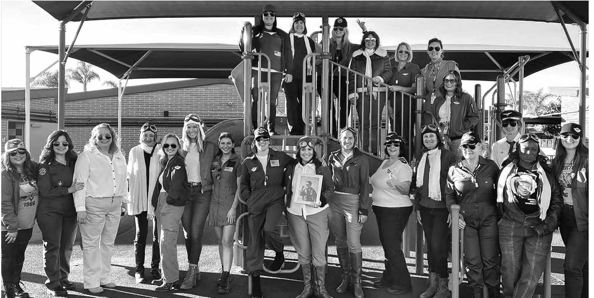
Aviation staff took flight celebrating their new school name by dressing as aviators. Aviators unite.