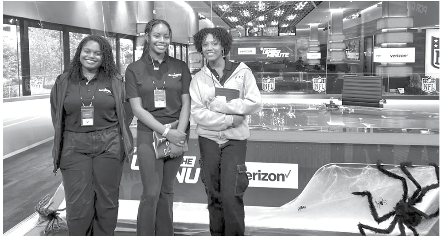
In partnership with Play Equity, SoFi Stadium, Hollywood Park, and the NFL Network, our Alliance students participated in a career lab excursion. Our students had the opportunity of touring both the SoFi Stadium and the NFL Network facilities and shadowing dedicated professionals across various departments. This unique opportunity granted them an insightful, behind-the-scenes perspective on stadium operations and a sneak peek into the intricacies of content production at the NFL Network.