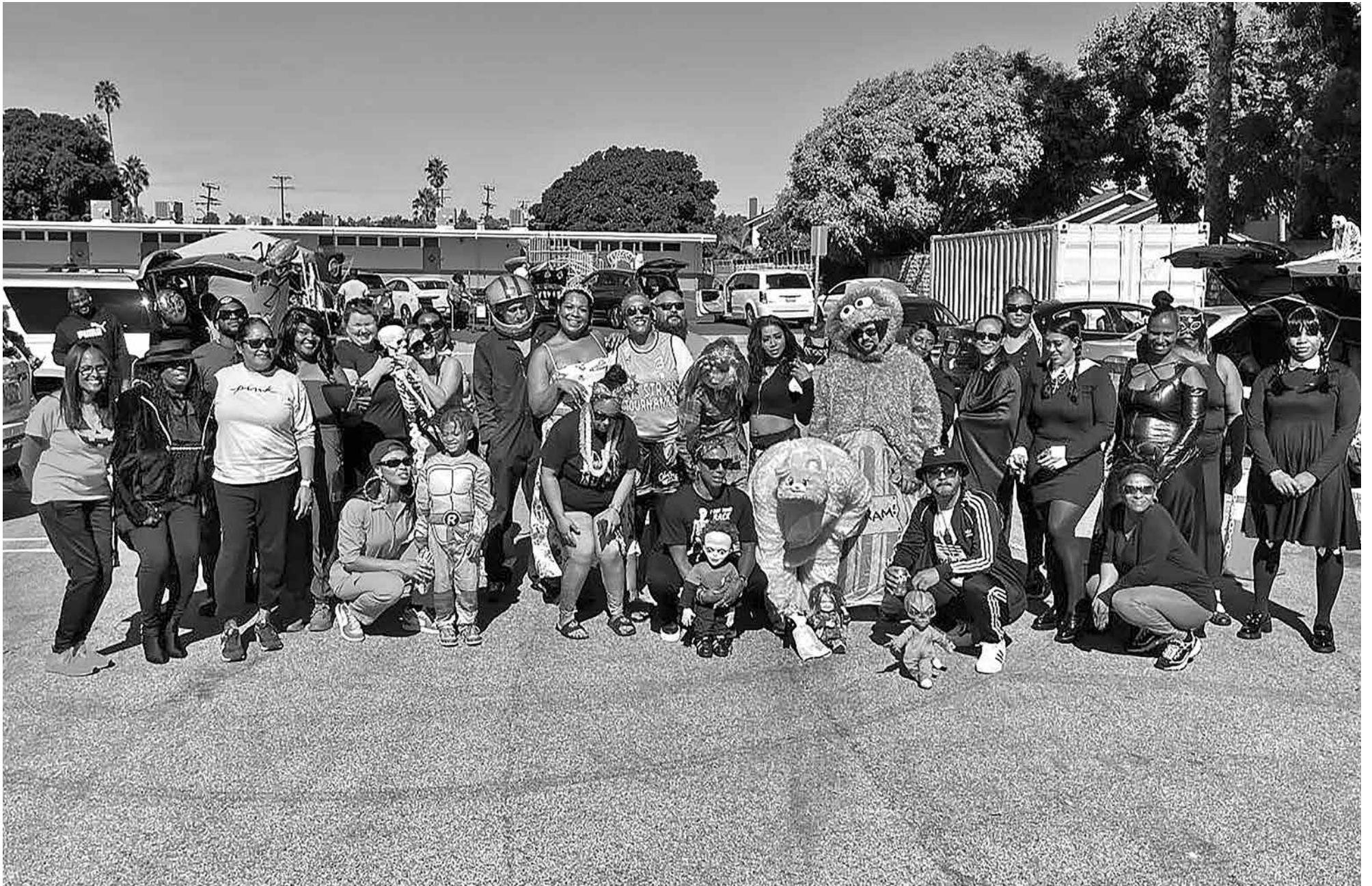
Parent Elementary PTA and the school community came together to celebrate the fun festivities of Halloween.