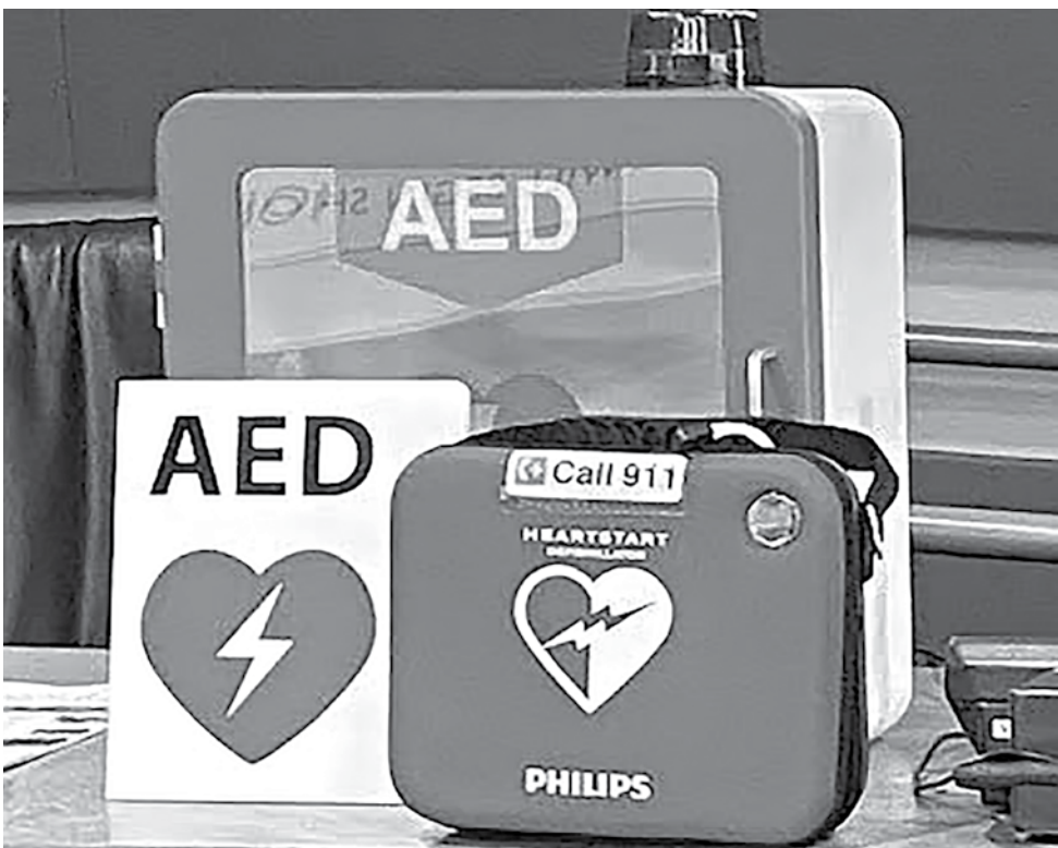
The AED Package.