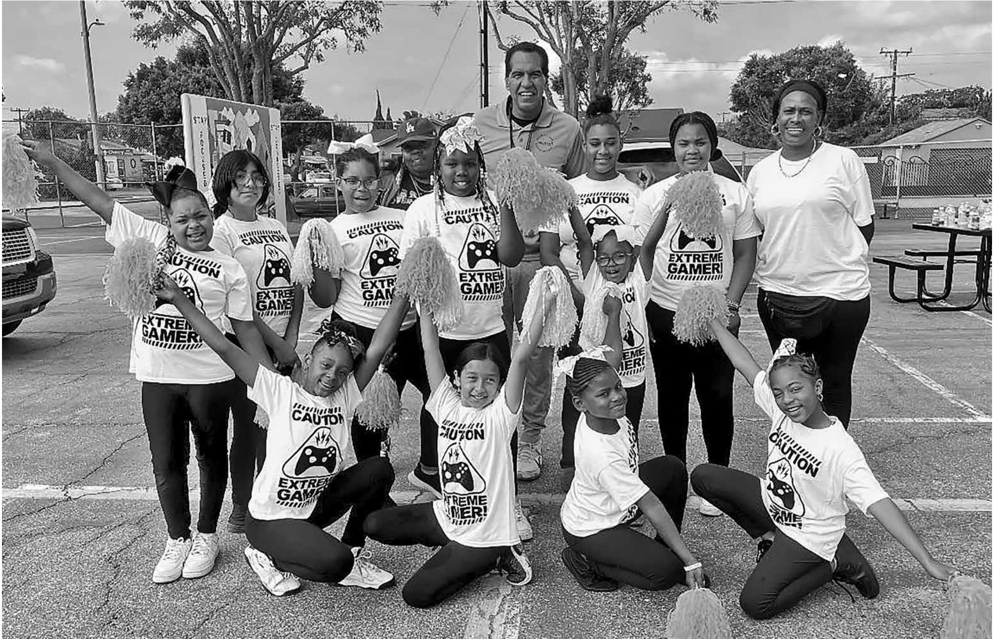
This past weekend, IUSD's Flag Football Camp was hosted at Bennett-Kew P-8 Leadership Academy of Excellence. Students across our elementary school sites participated in a variety of football drills, activities and games. The teams were accompanied by our remarkable student athletes from City Honors International Preparatory School and Morningside High School, camp counselors, and coaches who volunteered to cheer and mentor our younger youth. The celebration does not end there, as our Bennett-Kew cheer squad performed by cheering on the teams and showing their school spirit pride.

"Democracy is based upon the conviction that there are extraordinary possibilities in ordinary people."