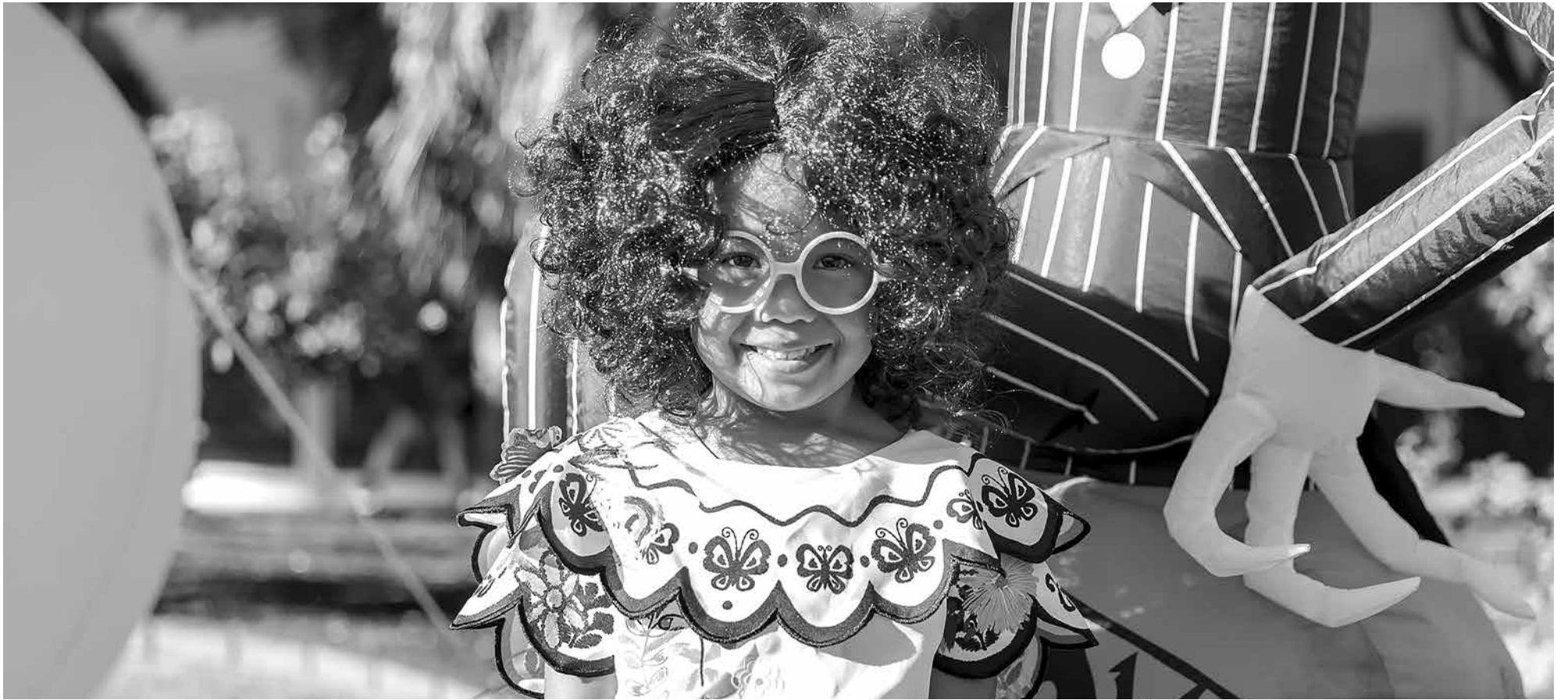
The Annual Spooktacular event was held on Saturday, October 29th 2022 at the Hawthorne Memorial Center parking lot. There were tons of families that came in costumes with their kids to enjoy a safe trick or treating environment around the Memorial Center. Kids enjoyed games and bouncers and lots of candy.