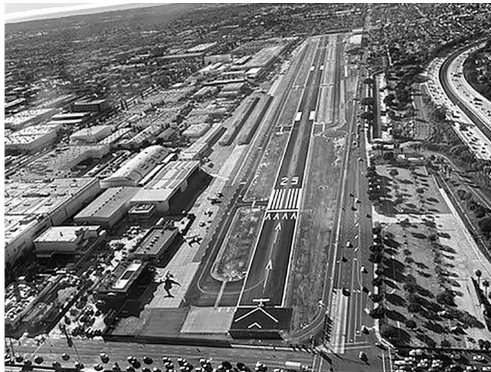
Runway at Hawthorne Airport.