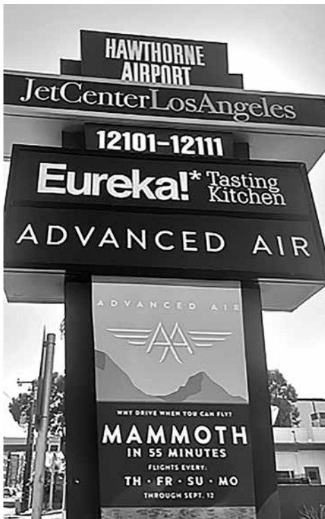
Welcome to Hawthorne Airport.

Yes, there is quite a history to this former modest airstrip. Said another way, "The sky's the limit!" The Hawthorne Airport is still growing up. •