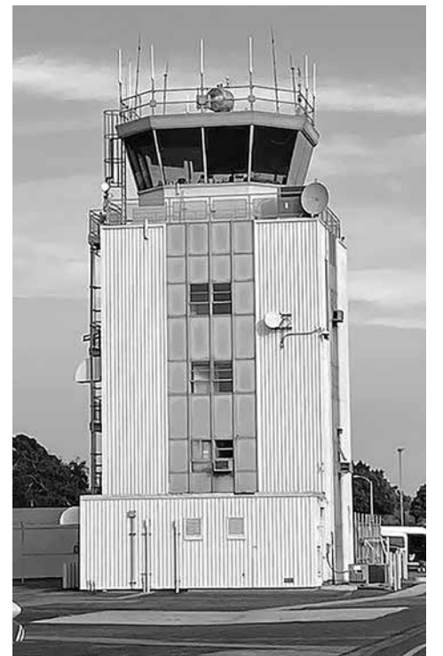
Hawthorne Airport tower.