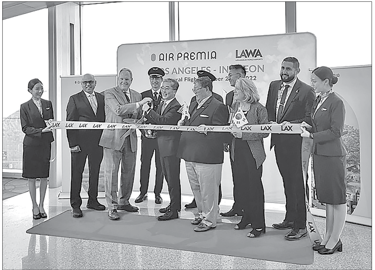
LAX welcomed their newest airline partner, Air Premia, offering five weekly flights from Los Angeles to Incheon International Airport (ICN) in South Korea.