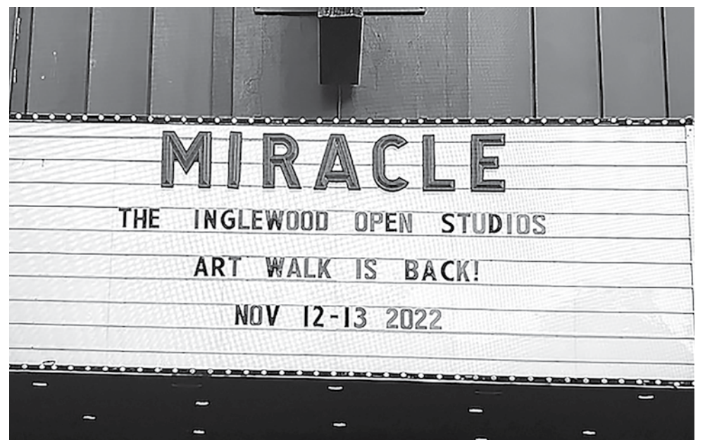
The Art Walk is Back.

Well, the bottom line is Inglewood is a great community. Both the City and the Inglewood Art Walk are proud, and rightfully so. Did I say the excitement is palpable? •