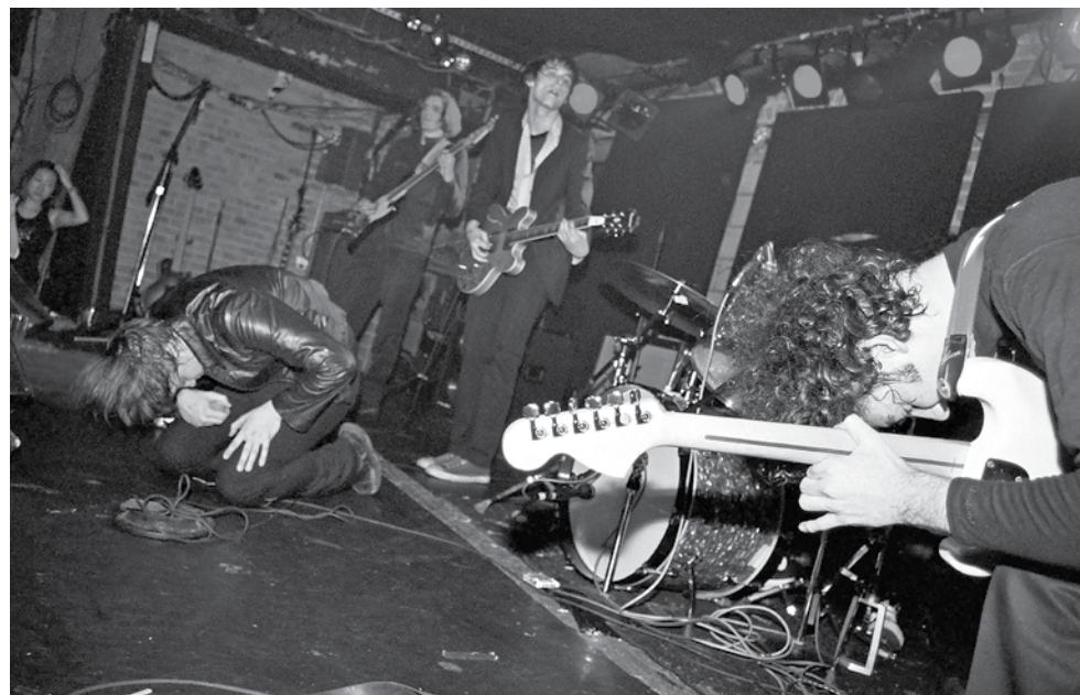
Meet Me In Bathroom.

feelings, traveling back in time. There are no modern day interviews spliced in, which feels totally transportive to the era. With incredible never-before-seen footage, we see what it was to live in New York on the cusp of the new millennium, pre-internet and pre-9/11. As the doc shows, a few bands—looking for a new kind of rock music—emerged with a “new cool” rock aesthetic, born out of the true indie music scene. The Moldy Peaches, Yeah Yeah Yeahs, and of course, the band that would almost single-handedly explode the scene, The