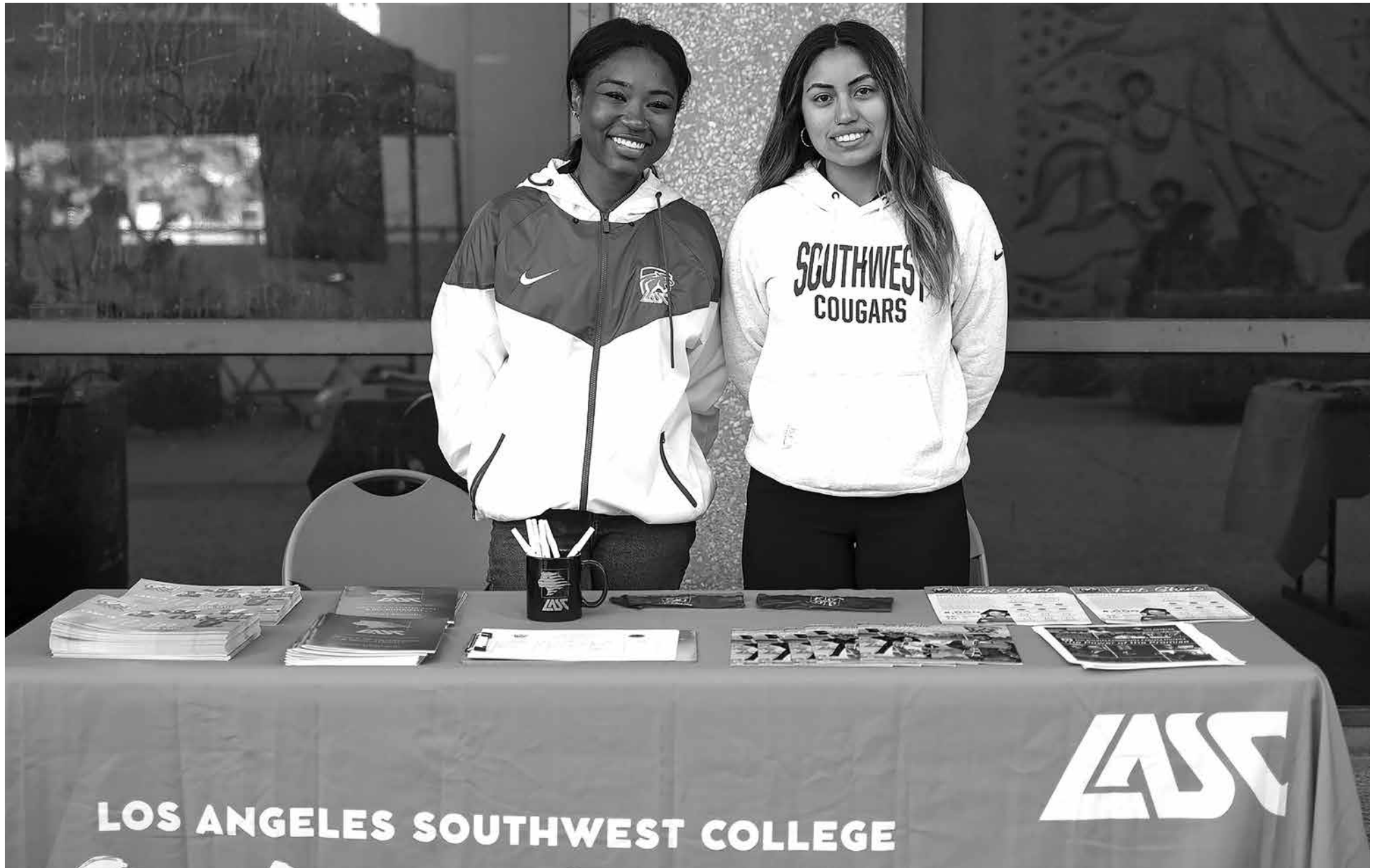
Super shout out to our community partners Grow Ready Org (GRO) and AADAP's Youth United in Creative Action (YUCA) for their commitment to empowering our young people. Our Champions for College Fair at Inglewood Public Library was a success.