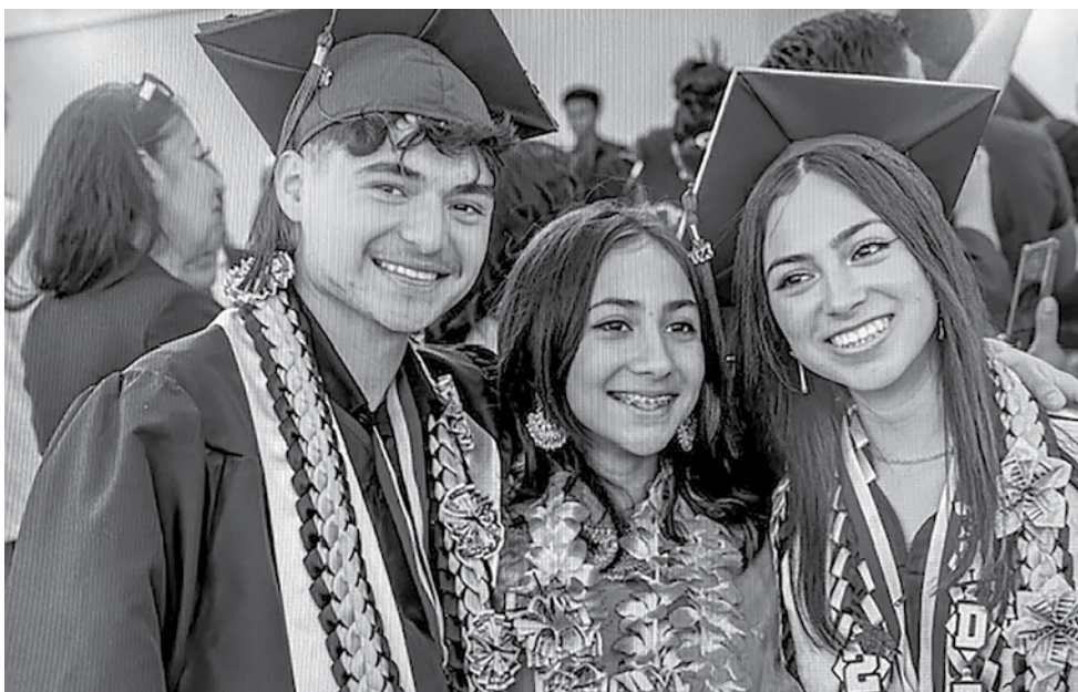
Math and Science Academy.