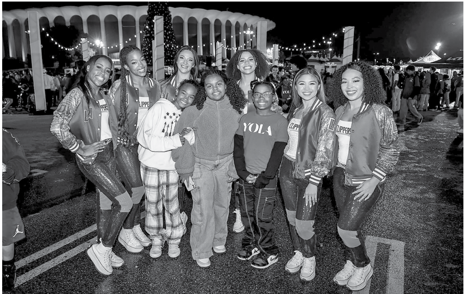
The night at the Kia Forum was filled with music, laughter, and heartwarming moments that spread cheer throughout the Inglewood community.