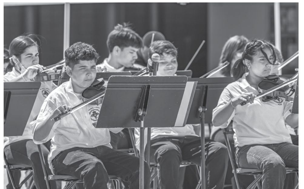
Prairie Vista Middle School.