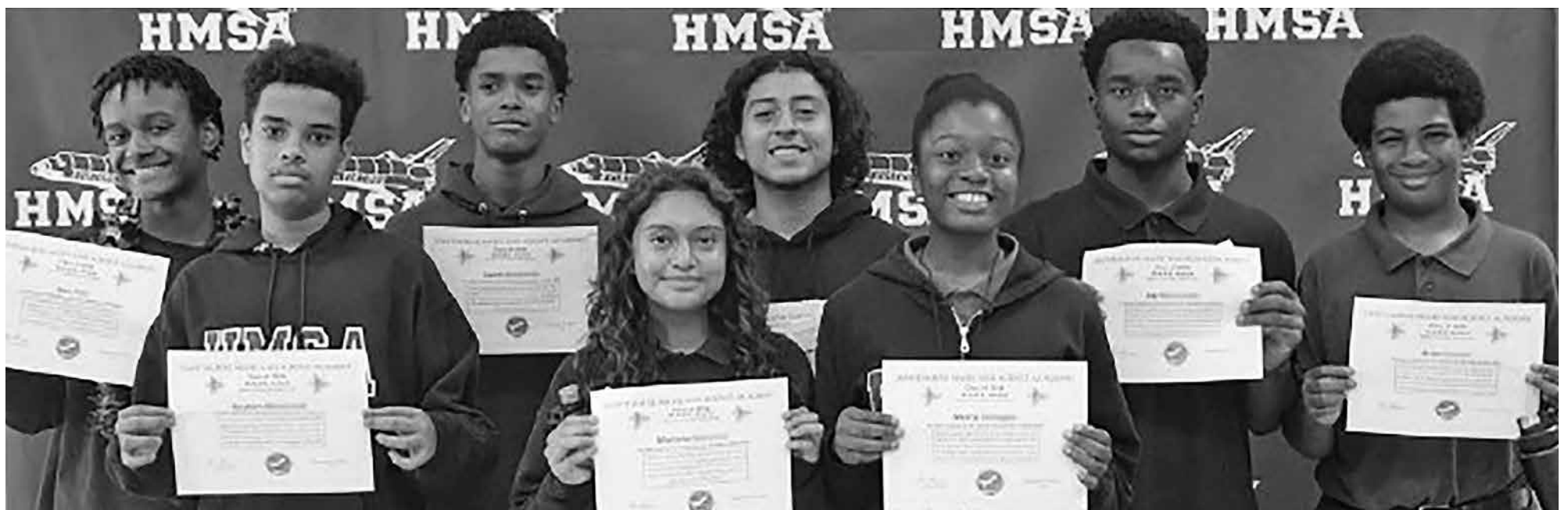
We are so proud to recognize our MARK award winners for their outstanding leadership traits at HMSA. Our MARK (Motivation, Accountability, Respect, Kindness) program was initiated to promote and recognize the development of such characteristics among our students.