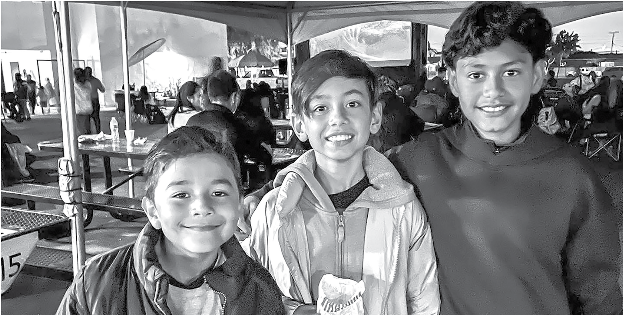
A big thank you to our Smith PTA and Staff for our 2nd Annual Family Movie Night. There was an amazing turn out by our cheetah families.