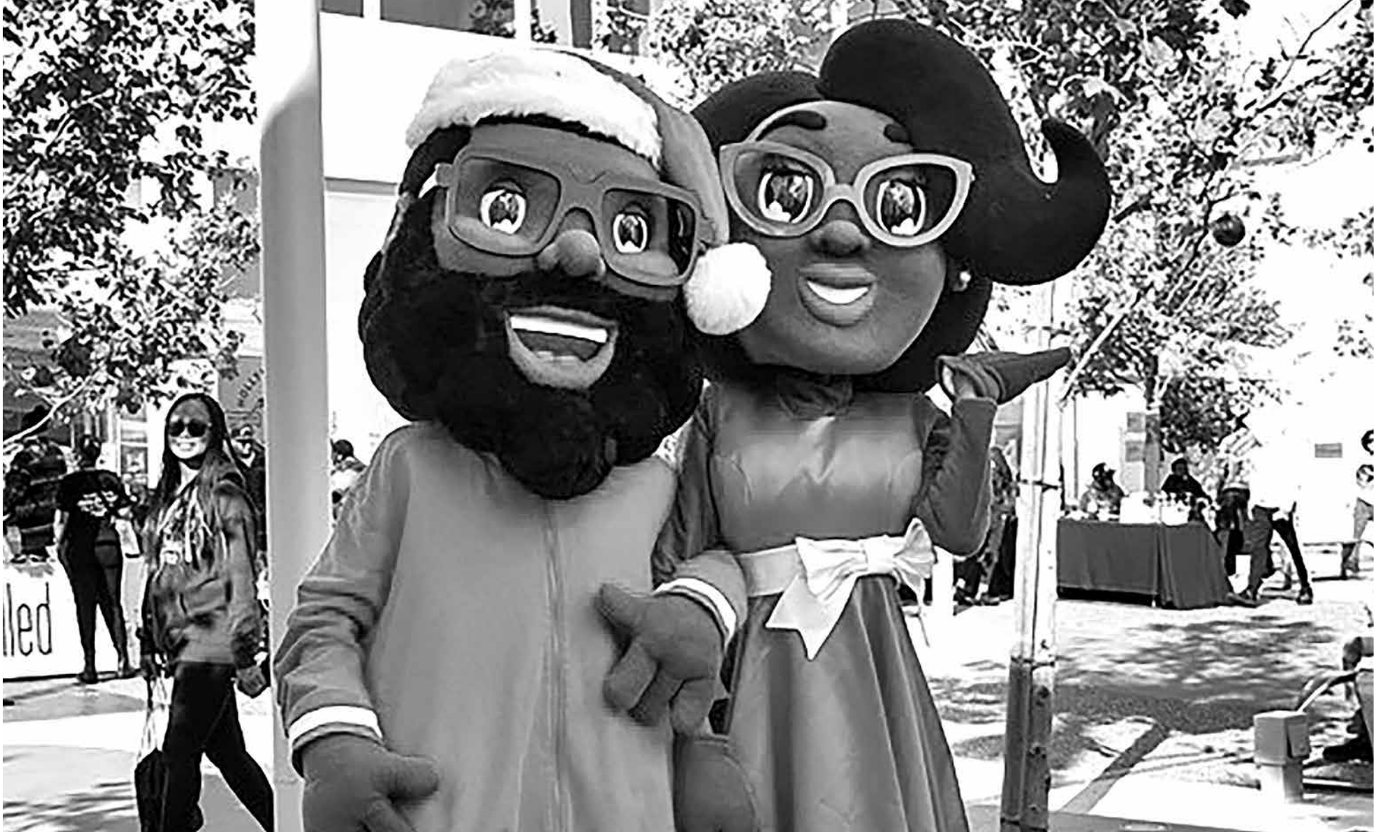
Spend the day meeting Black Santa, shopping local vendors, enjoying live entertainment, getting creative with holiday arts and crafts and so much more. The Farmers' Market with Farm Habit starts Saturday, December 2nd at 9:00 am and Winter Fest will start shortly after, at 11:00 am. More details are available at: https://hollywoodparkca.com/winterfest/ .