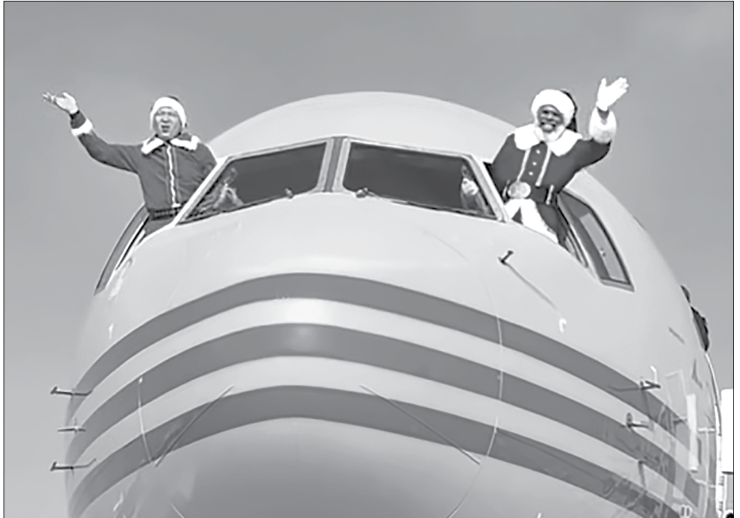
It may be 70 degrees outside, but Santa still touched down at LAX. Next stop: your chimney. Happy Holidays.