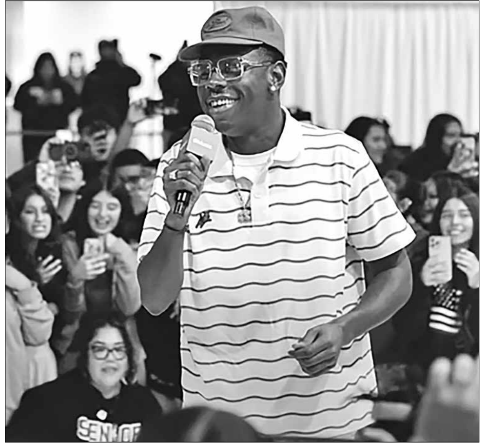
To celebrate his Apple Music Artist of the Year honors, Tyler, The Creator pulled up on his old high school to surprise Hawthorne High's class of 2026. At Tyler's request, Apple Music provided every Hawthorne HS senior with an iPad Pro and an Apple Pencil. Tyler attended Hawthorne high school from 2005-2008. Thank you Tyler for inspiring our Seniors to reach for the stars.