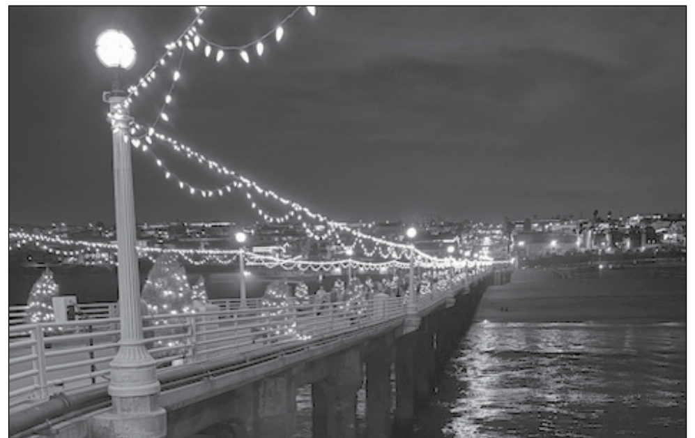
Redondo Beach Pier.