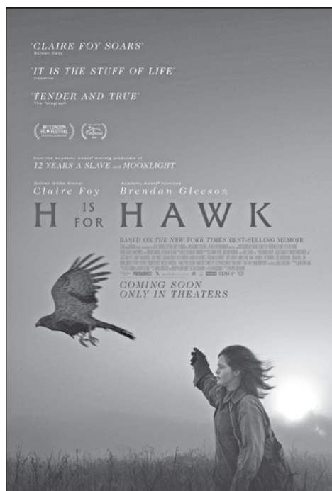
H is for Hawk

H is for Hawk had a limited run in mid-December, and will open theatrically on January 23, 2026. •