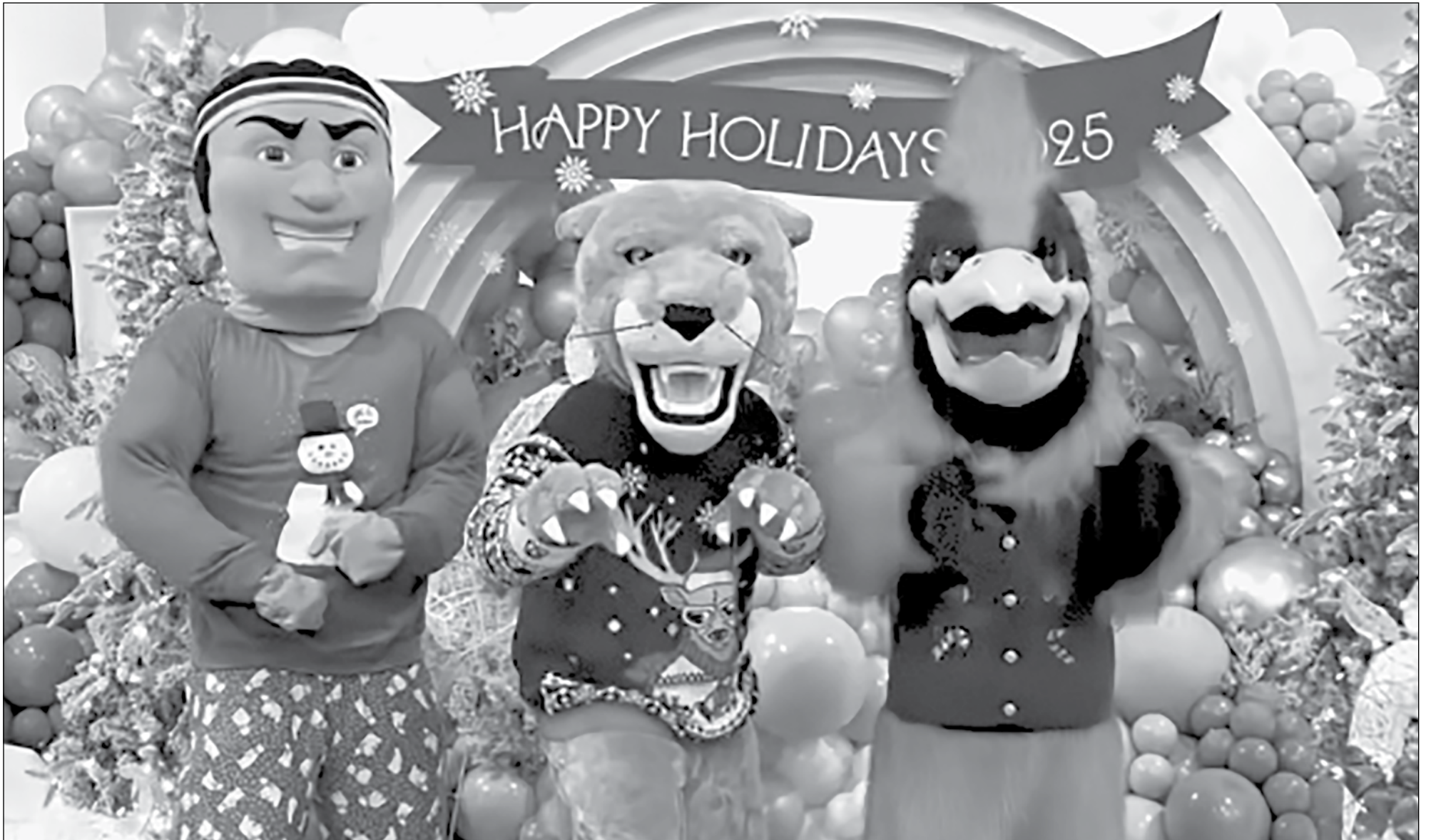
Wishing all our Centinela Valley Union High School District Families a wonderful Holiday Season.