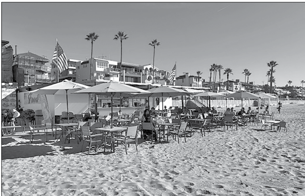
Beach Café.