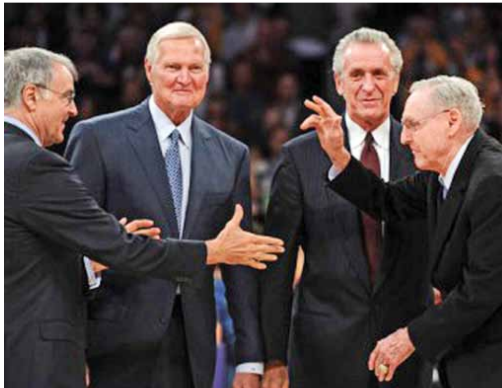
Bill Sharman, right, acknowledges the crowd with Gail Goodrich, left, Jerry West and Pat Riley during a 2012 ceremony at Staples Center to honor the 1971-72 team on its 30th Anniversary.

What about the future of Sharefest? They have just moved into a new building which will allow them to extend their youth programming providing a positive, safe place to learn. They plan on establishing a Youth Development Center, which will help local youth explore and engage in positive contributions that they can make within their