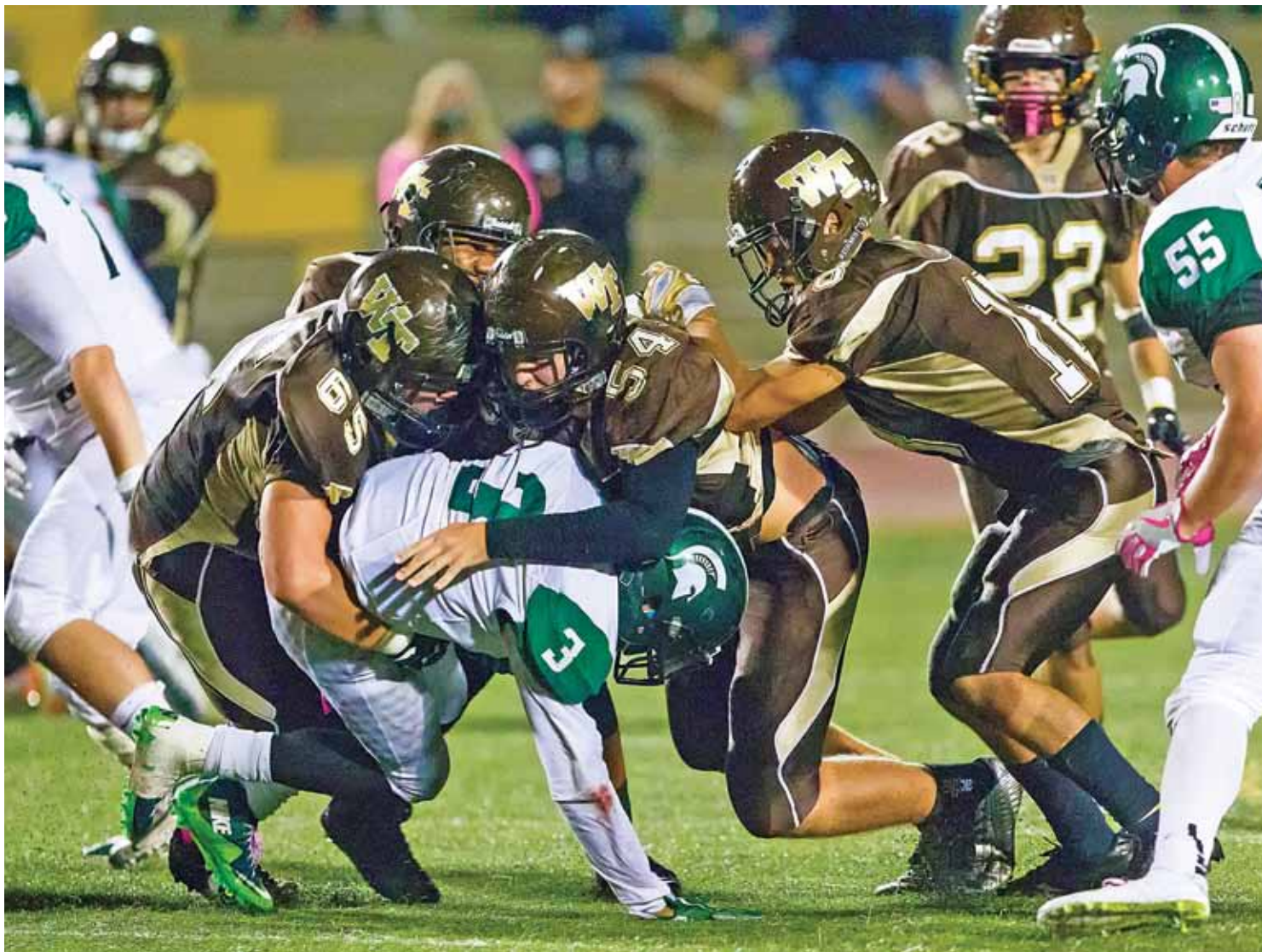
The West Torrance High School football team remained undefeated in the Pioneer League after a 28-0 win over South Torrance last Friday. The Warriors improve to 6-2 overall on the season and 3-0 in league play. West will travel to Leuzinger Friday for a 7 p.m. kick off. For more photos see page 5 and 12. •