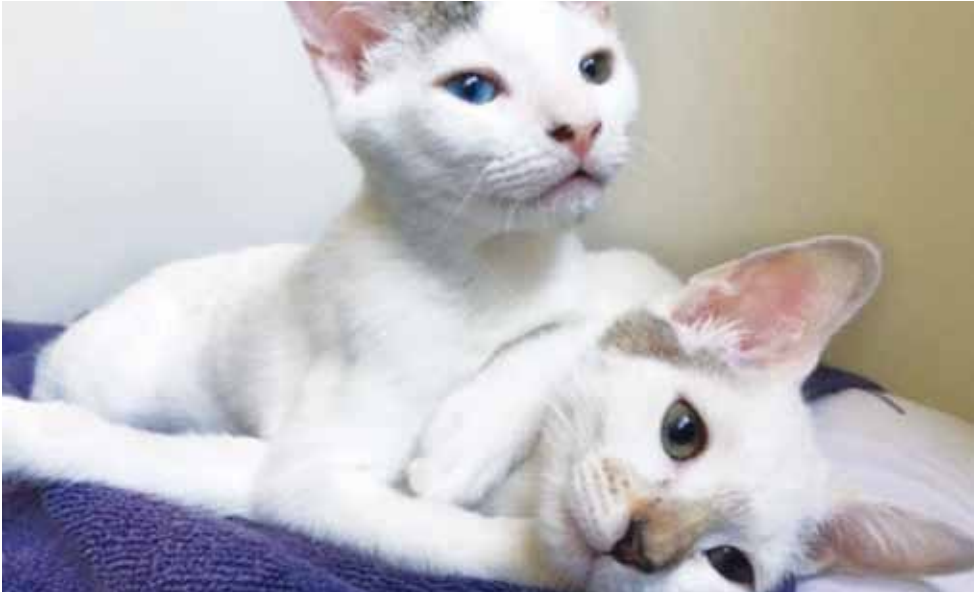
Charlie and Chloe

Ragnar is pure joy. It must be good to be Ragnar, because everything is just so much fun for him. He is a super sweet, cuddly, affectionate goofball with just a hint of cerebellar hypoplasia (his reward for surviving panleukopenia). Its not enough to cause any real impairment, but enough so that he has a slight head bobble and is clumsy, in a very endearing way. It certainly doesn't slow him down as he gets the zooms just like any other kitty his age. Ragnar has been brought up in a home with several cats and kittens as well as dogs. He's more a fan of his feline compadres and would be a great companion for anyone who likes to cuddle and play. Ragnar will certainly a smile to your face with his sweet and clumsy shenanigans. These kitties are available for adoption through Kitten Rescue, one of the largest cat