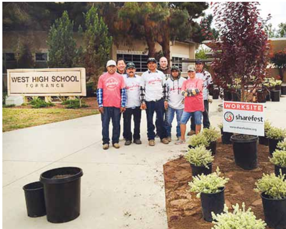
Sharefest Volunteers Beautifying West High School grounds.

This amazing organization runs on funds donated by community businesses, and their annual gala. This year, the 13th Annual 2016 Sharefest Gala, takes place on Saturday, Nov. 5, at the Torrance Marriott at 6 p.m. The event, An Evening of Everyday Heroes, Architect of Transformation, will honor Jerry West with the Bill Sharman Humanitarian Award, presented by Mychal Thompson. Master of Ceremonies for the evening will be John Ireland. This prestigious award will be bestowed on Jerry West for his selfless philanthropy. "There are people who leave an indelible mark of excellence upon the lives of others as they propel them to achieve greatness. For as long as I have known him, Jerry West has been helping others fulfill their dreams on and off the