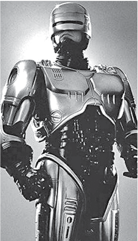
This movie character inspired a robocall-stop bill in Washington.