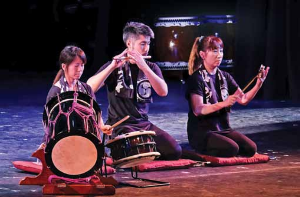
The performance included other instruments besides the Taiko.