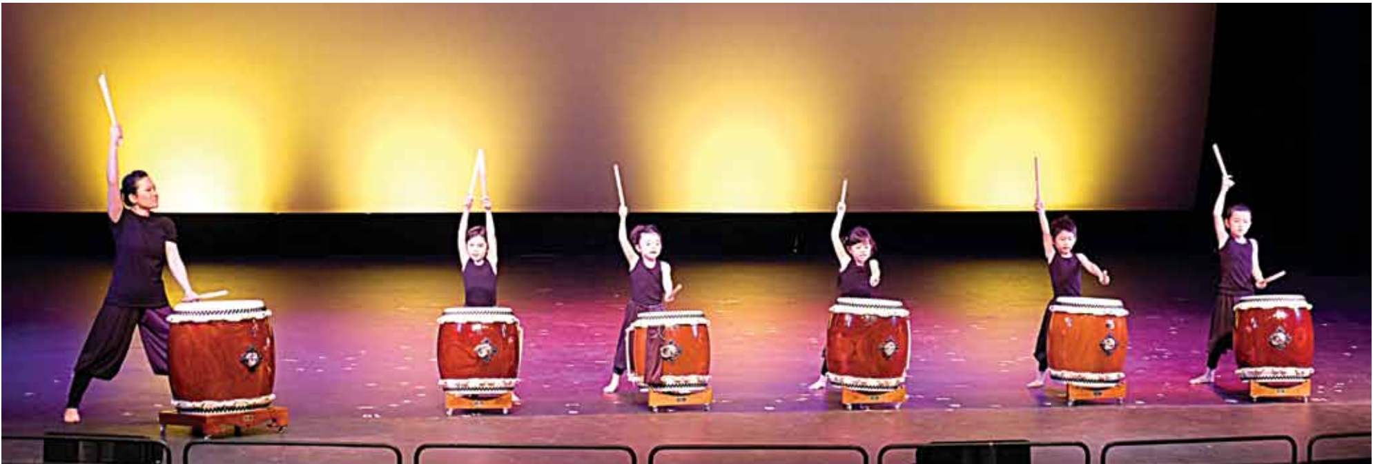
Over 150 Taiko students performed, including the very young who were enthusiastic and professional.