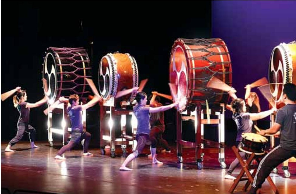
The energy and power of this group shook the theatre.