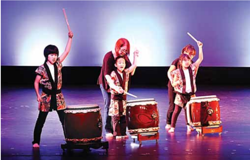
The event included an outstanding performance by a group of young ones with special needs.

amazing performances as well as explanations of the roots and contexts of Taiko, a demonstration of the “kuchishoga” aural teaching method, and commentary on the challenges of learning to play these traditional Japanese drums. •