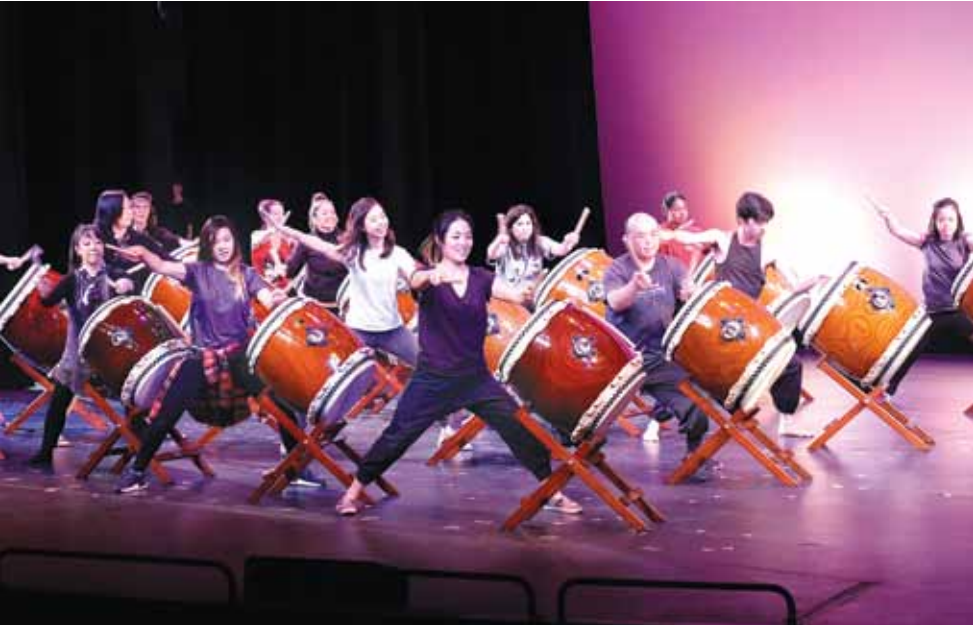
The emotions of the players highlighted how much fun they were having.