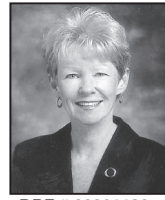
DRE # 00891136

Call an Independent Broker for all your Real Estate Needs!