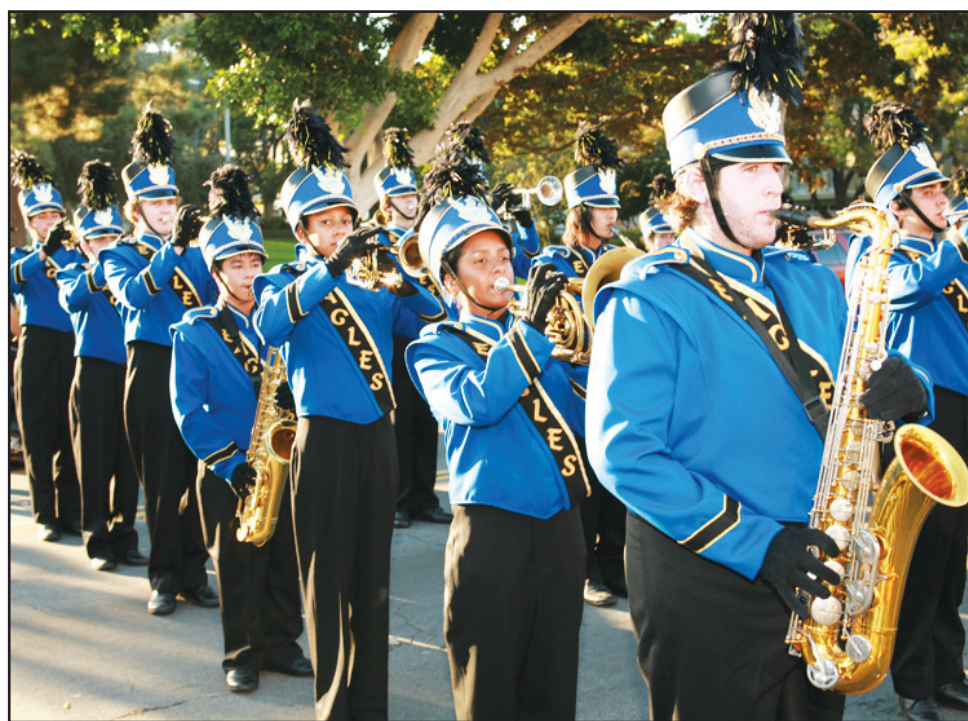
Band members play for the crowd.