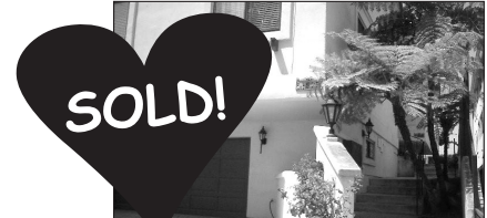
731 Washington Street, ES