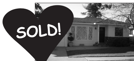
823 Washington Street, ES