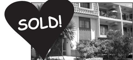
900 Cedar Street, ES