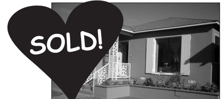
524 Concord Street, ES