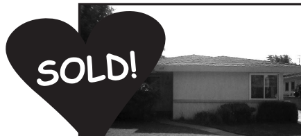
808 California Street, ES