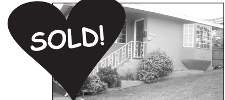
539 E. Walnut Avenue, ES