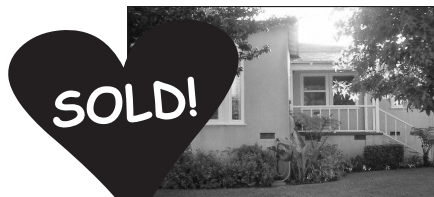
841 Loma Vista Street, ES