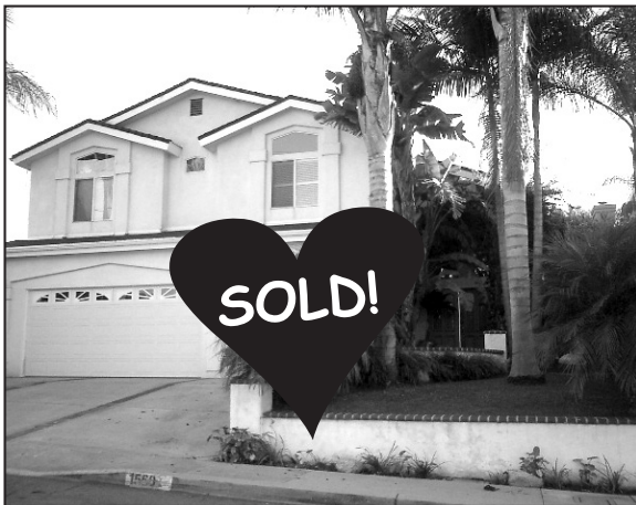
1560 E. Palm Avenue, ES