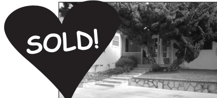
714 Hillcrest Street, ES