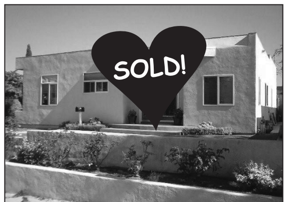
1132 E. Acacia Avenue, ES