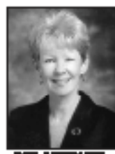
DRE # 01001120

Call an Independent Broker for all your Real Estate Needs!