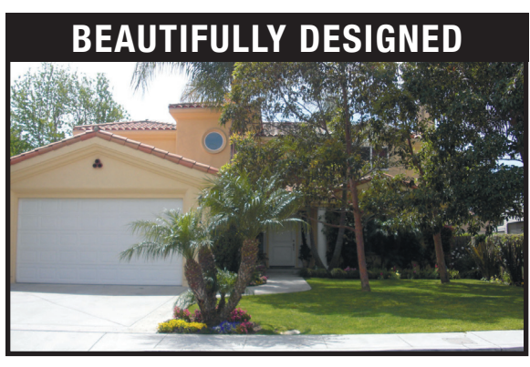
1444 E Palm — 5 bedroom, 4.5 bath beautiful home with open floor plan. Hardwood floors, Family Rm & Living Rm with fireplace. Gourmet kitchen with walk-in pantry. Large master bedroom suite.