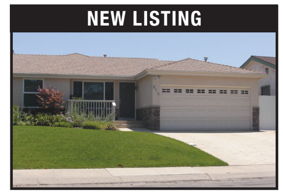
614 Bungalow - Beautifully remodeled 3 bedroom, 2 bath home with hardwood floors throughout, recessed lighting and attached garage. Nicely landscaped backyard great for entertaining.