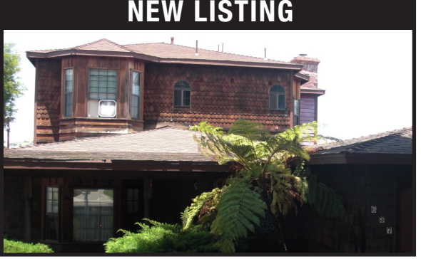
637 W. Pine — 5 bedroom, 3 bath home located in highly desireable area on a large lot.