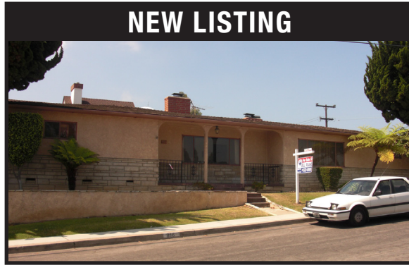
816 E Pine — 3 bedroom, 1.5 bath home with pool.Open beam ceilings and great home for entertaining.