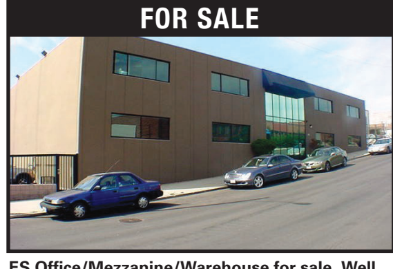
ES Office/Mezzanine/Warehouse for sale. Well maintained building that is approximately 18,102 sq ft with gated parking. Listed for $3,900,000. Call for further details.