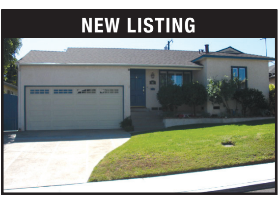
747 Lomita-Enchanting 3 bdrm, 1.75 bath, home includes a spacious living room, beautifully updated kitchen w/granite counters & pergo flooring. Master suite w/ vaulted ceilings, fireplace, & private bath.