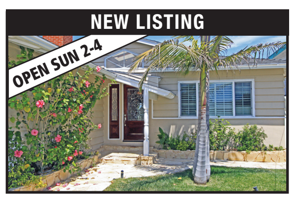
350 Hillcrest- 3 bedroom, 2.5 bath home with hardwood floors throughout, recessed lighting, large kitchen. Spacious open floor plan with great city views!

WANT TO SELL BY THIS SUMMER? PLEASE CALL FOR AN APPOINTMENT 7 DAYS A WEEK UNTIL 9PM 310-877-2374