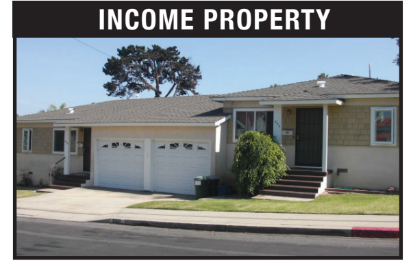
536/540 W. Maple - Well maintained Duplex. Each unit includes 2 bedrooms, 1 bath with individual front yards. Recently sound-proofed with large living room and eat-in kitchen.