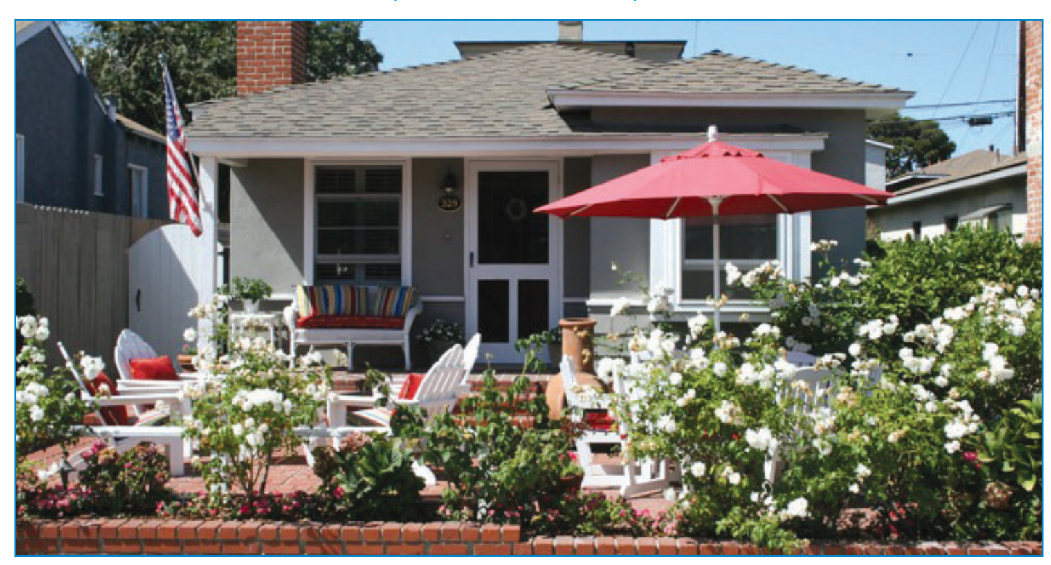
329 4th Street Manhattan Beach