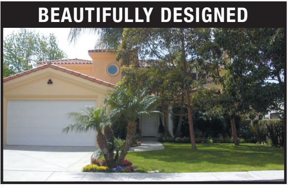
1444 E Palm — 5 bedroom, 4.5 bath beautiful home with open floor plan. Hardwood floors, Family Rm & Living Rm with fireplace. Gourmet kitchen with walk-in pantry. Large master bedroom suite.