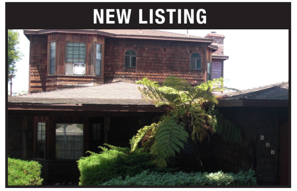
637 W. Pine — 5 bedroom, 3 bath home located in highly desireable area on a large lot.