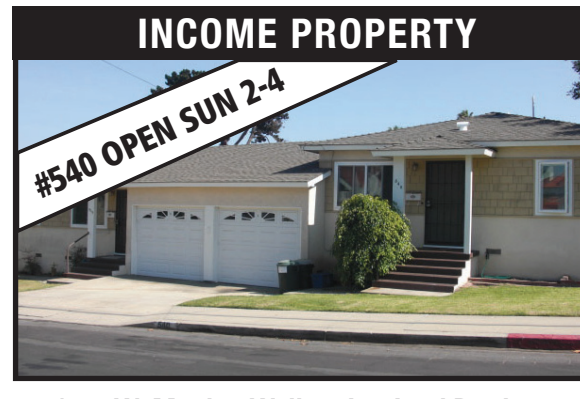
536/540 W. Maple - Well maintained Duplex. Each unit includes 2 bedrooms, 1 bath with individual front yards. Recently sound-proofed with large living room and eat-in kitchen.