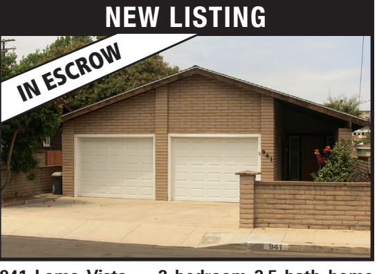
941 Loma Vista — 2 bedroom 2.5 bath home with bonus room. This home has been remodeled and has spacious bedrooms, cooper plumbing, open kitchen with granite counter tops, breakfast bar, and family room.