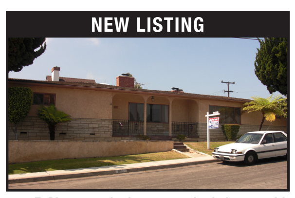
816 E Pine — 3 bedroom, 1.5 bath home with pool.Open beam ceilings and great home for entertaining.