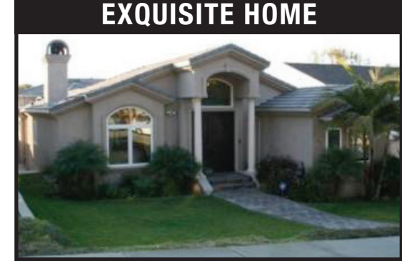
613 Sheldon— Exquisite 5 bedroom, 3 bath home with formal dining room, kitchen with cherry cabinets, granite countertops and slate floor. Large private master suite with fireplace, built-in whirlpool tub and shower.