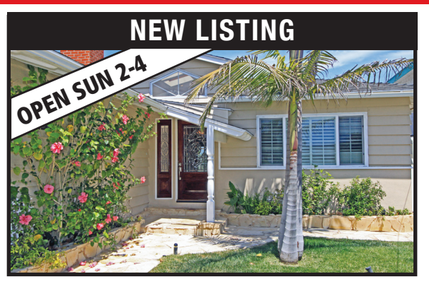
350 Hillcrest- 3 bedroom, 2.5 bath home with hardwood floors throughout, recessed lighting, large kitchen. Spacious open floor plan with great city