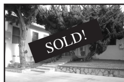
714 Hillcrest St.