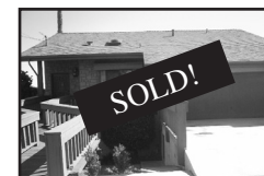
724 Loma Vista