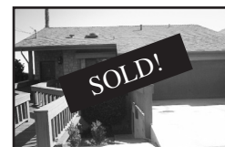
724 Loma Vista