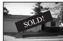
823 Washington St.