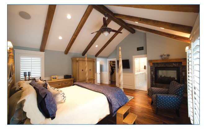
2100 Pine, Manhattan Beach • Offered at $2,295,000