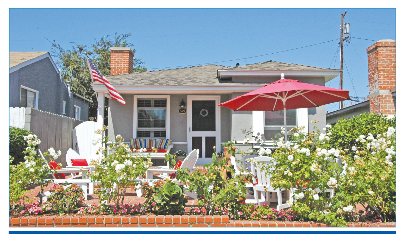
329 4th Street, Manhattan Beach • Offered at: $2,300,000

3 bedrooms, 2 baths, Remodeled kitchen opens to family room and patio, 1700 sq. ft. of living space, cozy family room, lovely front patio, great for entertaining, steps to beach, Robinson Elementary and downtown Manhattan Beach