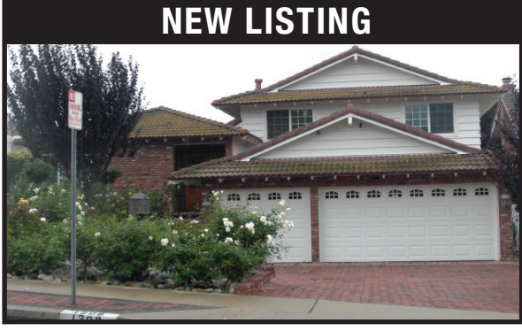
1208 E Sycamore- 4 bedroom, 3.5 bath spacious home with upgraded kitchen with granite counter tops, stainless steel appliances and breakfast nook Dining area and large livingroom with travertine flooring and fireplace and her vanitites. Backyard has lap pool with fountain and spa tub.