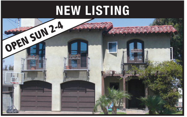
513 W. Mariposa - This spacious 4 bedroom, 3 bath home has a great open floor plan with gourmet kitchen with stainless steel appliances, formal dining room, living room with high wood beam ceilings and fireplace. This home has great upgrades throughout.