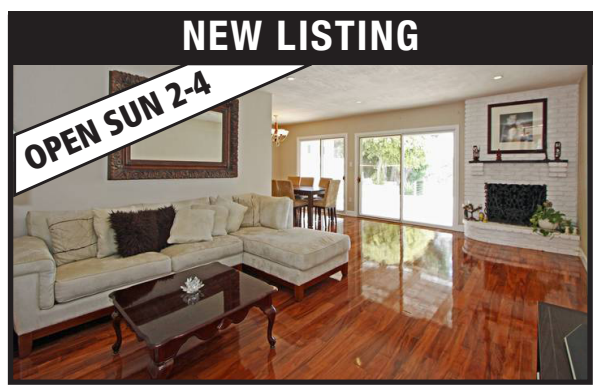
floors throughout, recessed lighting, large kitchen. Spacious open floor plan with great city views!