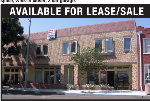
125 Richmond - First floor retail or office space with open floor plan approx 1,210 sq ft. On second level is a living quarters with 2 bed +2 bath w/living and dining area. Private roof top deck with ocean views.