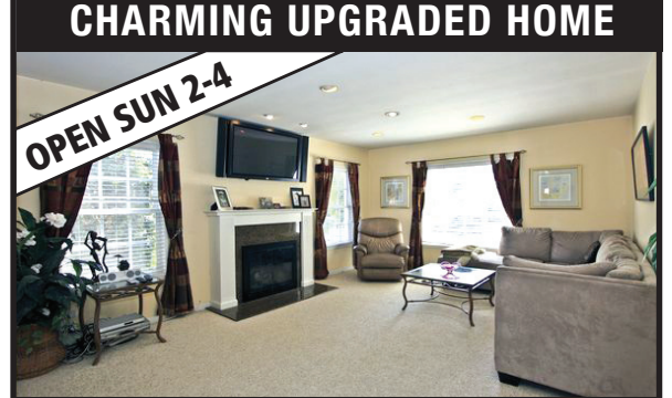
1005 E. Acacia - 3 bedroom, 2 bath home remodeled throughout with upgraded kitchen and large backyard great for entertaining. This home is a must see!!