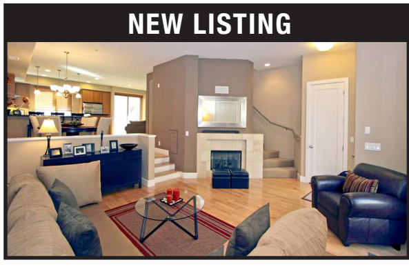
311 Kansas #C- 3 bedroom, 2.5 bath plus bonus room completely upgraded townhome. This spacious unit has open floor plan with hardwood floors. Living room with high ceiling and fireplace. Kitchen with granite counter tops and stainless steel appliance. Master suite with large walk-in closet and mater bath with spa tub.