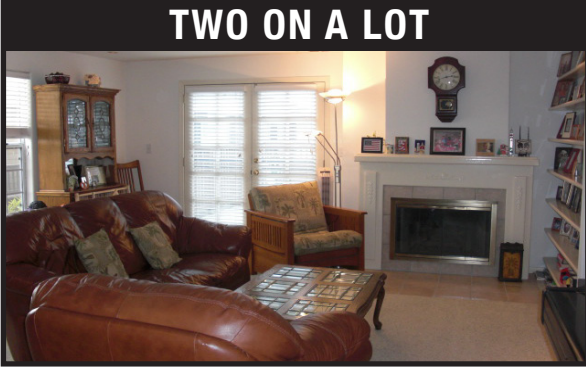
518/520 Sheldon - Great 2 on a lot, 3 Bed, 1.75 bath front house. Back house is 2 Bed, 2.5 bath featuring kitchen w/skylight & center island. Living room w/fireplace, recessed lighting, hardwood floors. French doors leading to large deck with city views! Master suite w/office