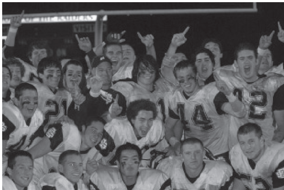
The Eagles' football team reacts to their first round CIF playoff win.