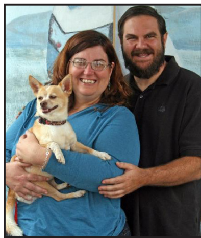
Chiquita happy forever with her new family.

Chiquita was one of our little gems waiting to have her dream come true. When she was adopted, her new family agreed that she truly was a little treasure just waiting for their love.