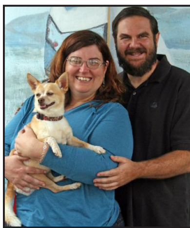
Chiquita happy forever with her new family.

Chiquita was one of our little gems waiting to have her dream come true. When she was adopted, her new family agreed that she truly was a little treasure just waiting for their love.