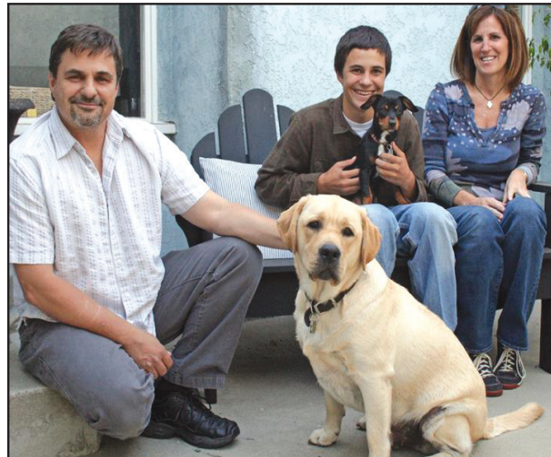
Cory scored! (Dog on lap)

Cory was a lucky pup thanks to the Manhattan Beach Fire Department's adoption event during the Manhattan Beach Hometown Fair. At that event, Cory found his forever home. Here's an update from his new family.