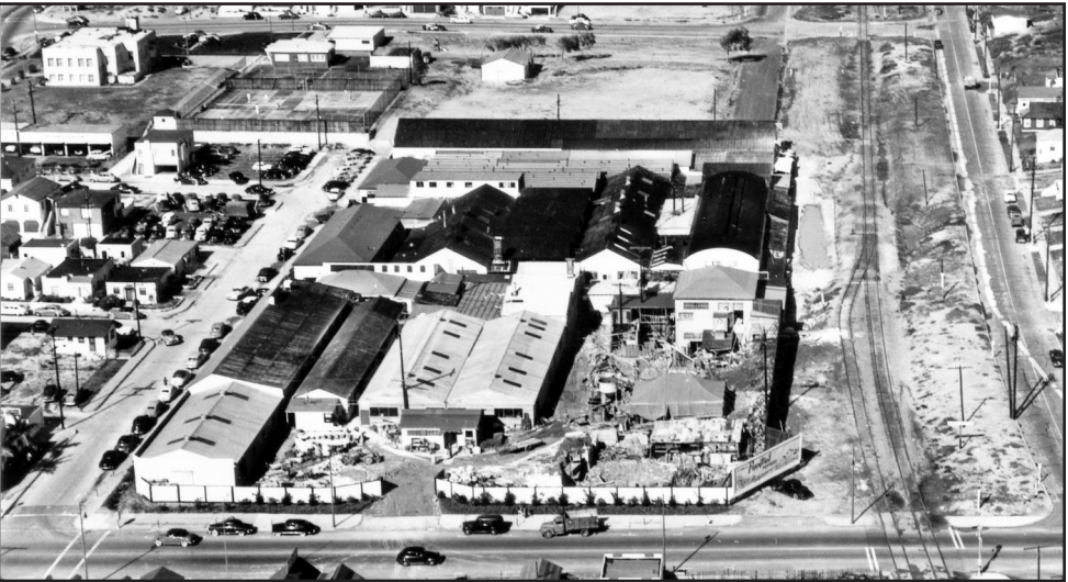
An aerial view in the early 1940s of Metlox and the Civic Center prior to the building of the previous Police and Fire departments. The large building to the upper left was the old City Hall, which occupied the present City Hall location.